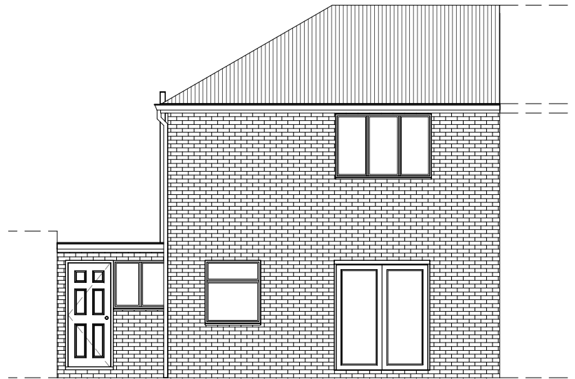
3 Rear Elevation 1 : 100