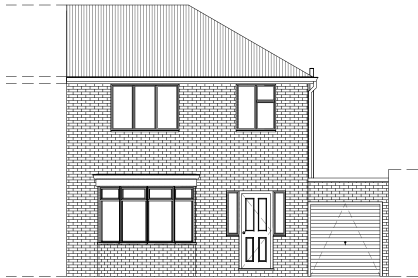
1 Front Elevation 1 : 100