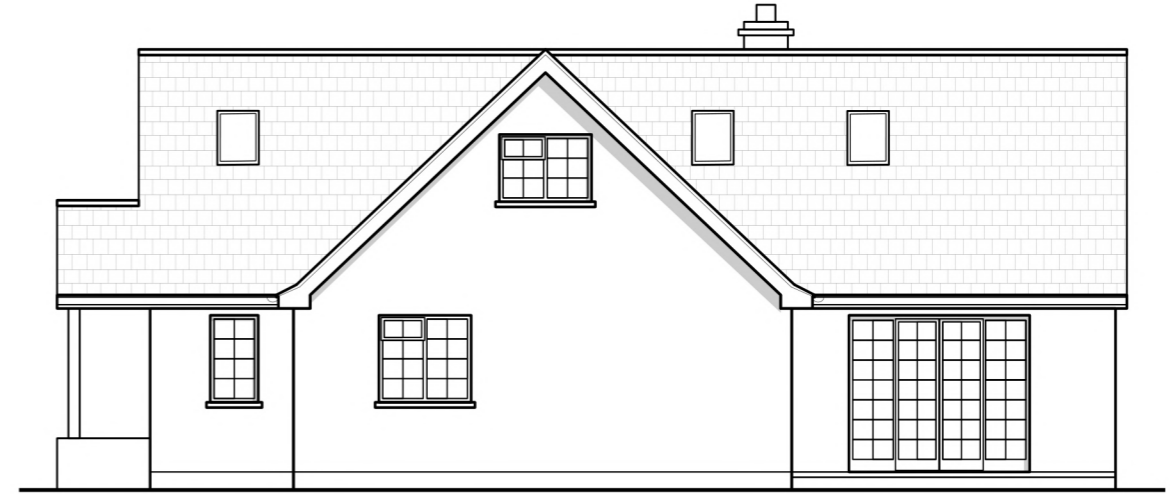
Existing West Elevation Scale: 1:100