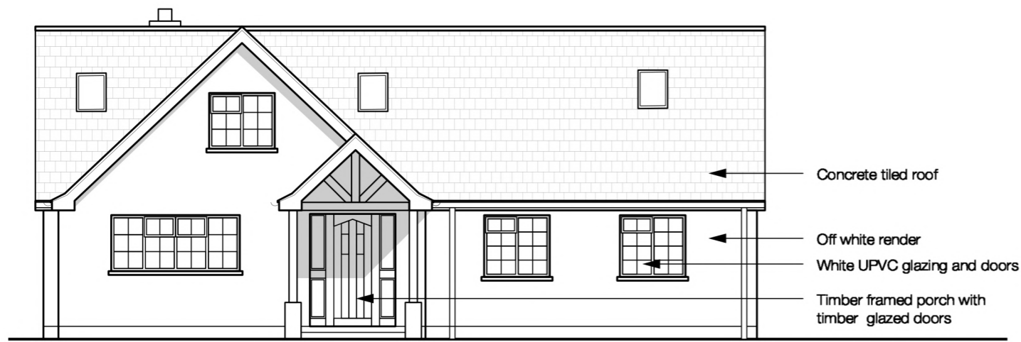
Existing North Elevation Scale: 1:100