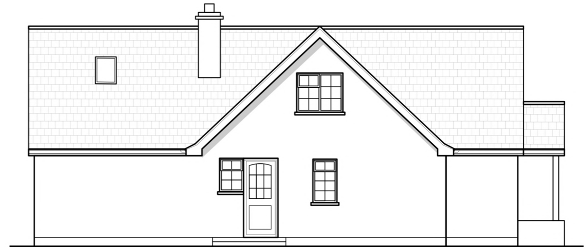
Existing East Elevation Scale: 1:100

General Notes : Do not scale off drawings. These drawings are concept only and are not for construction. all financial, structural and building control items are to be considered by additional specific professional advice