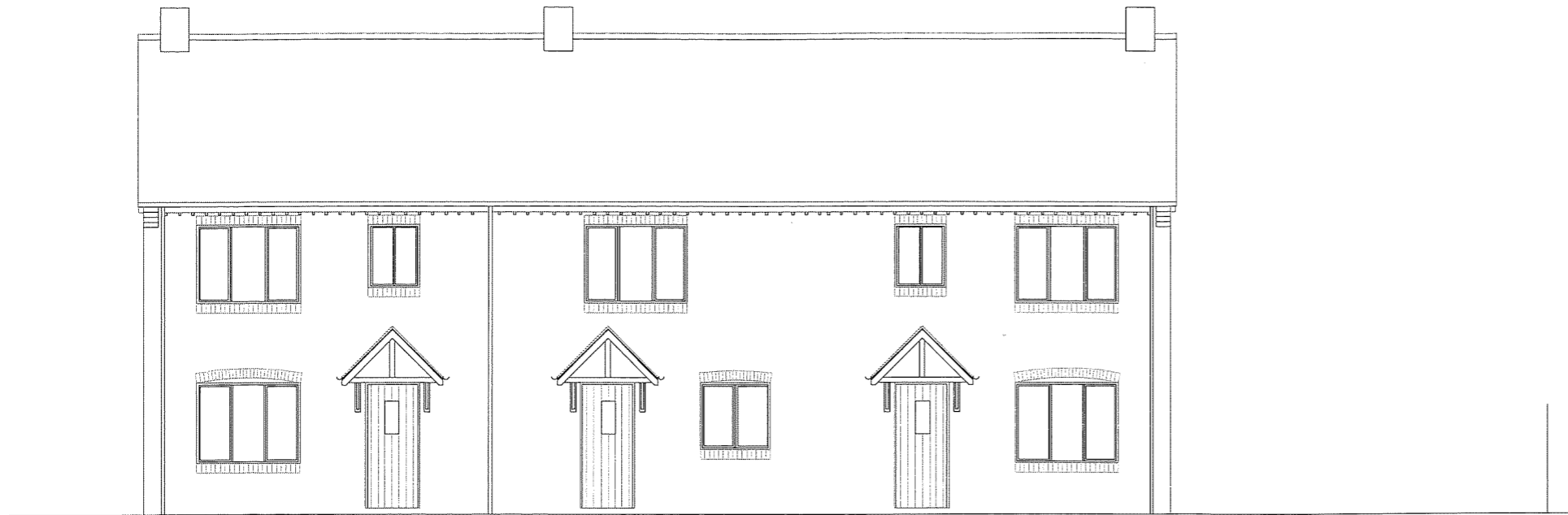
EXISTING STREET ELEVATION