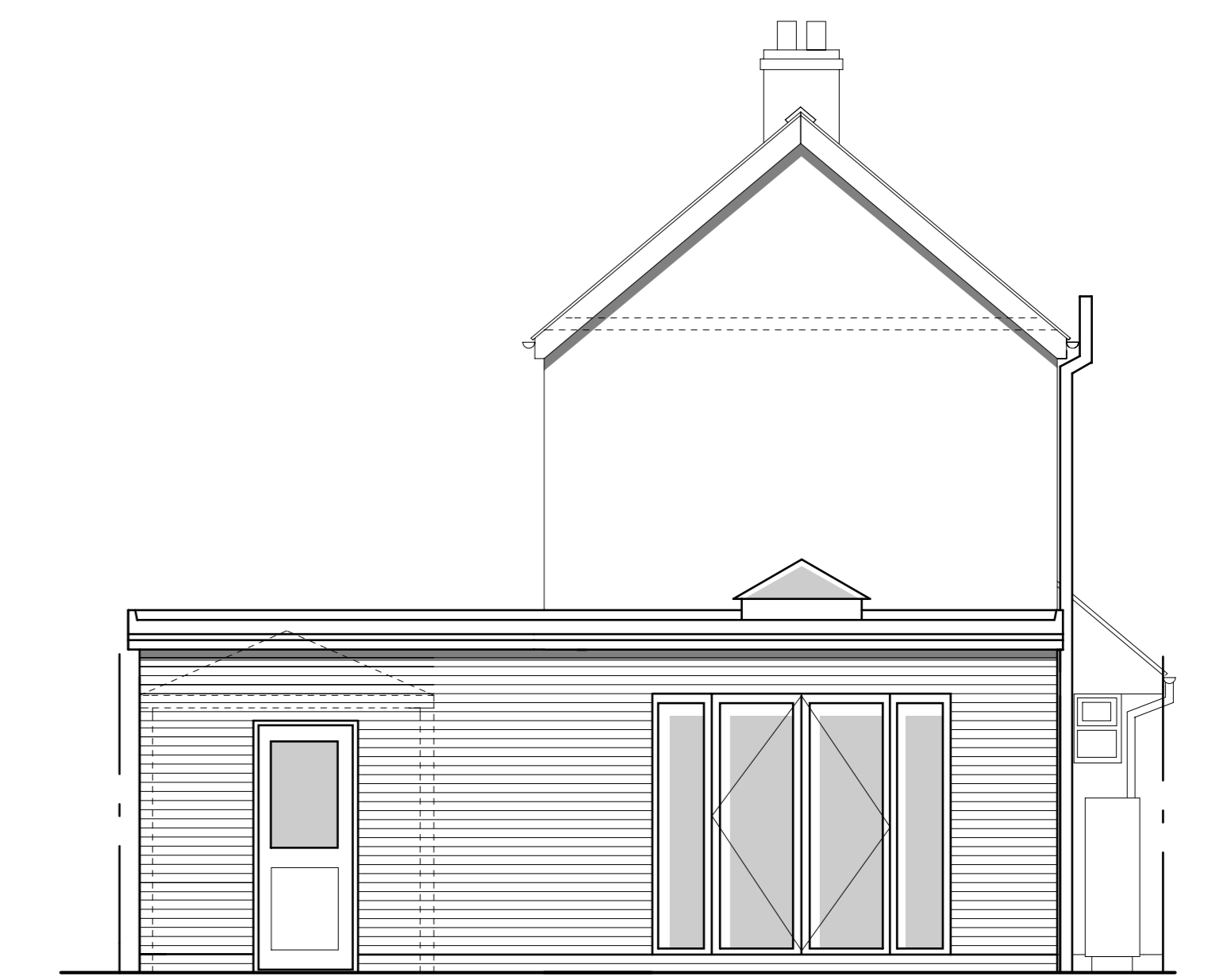
PROPOSED REAR VIEW