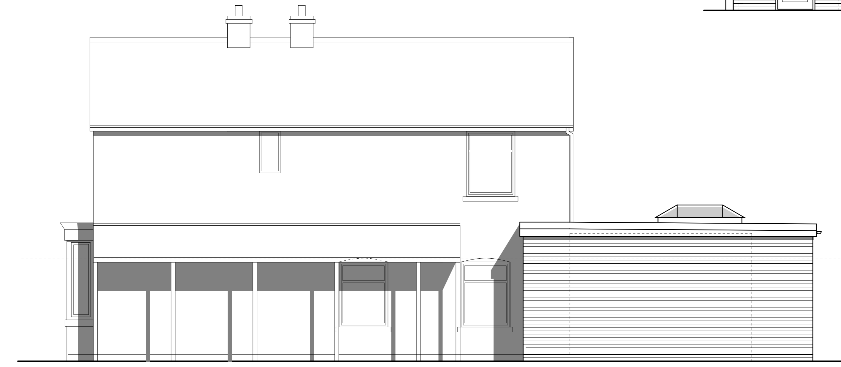
PROPOSED SIDE VIEW

THIS DRAWING IS THE COPYRIGHT OF BOTH CREATIVE PARTNERSHIP AND MAY NOT BE COPIED, ALTERED OR REPRODUCED IN ANY FORM OR PASSED TO A THIRD PARTY WITHOUT THE WRITTEN CONSENT OF BOTH CREATIVE PARTNERSHIP