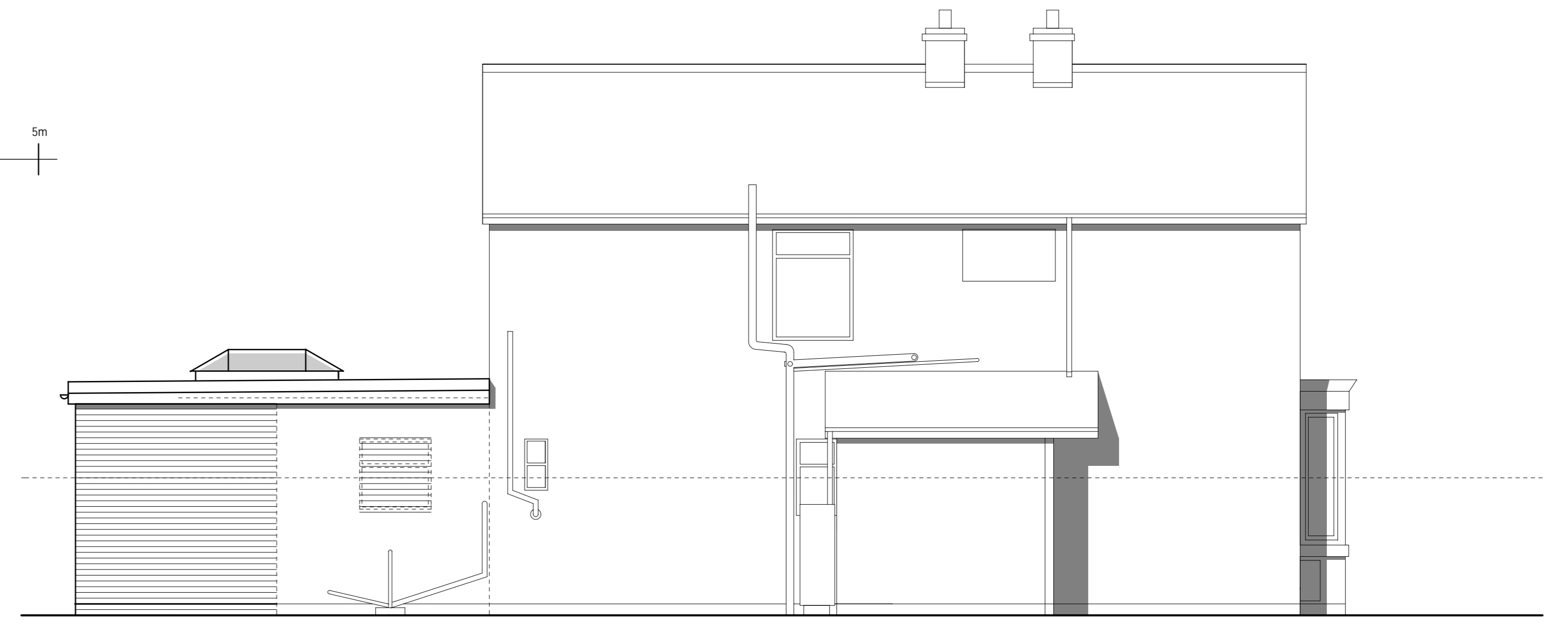
PROPOSED SIDE VIEW