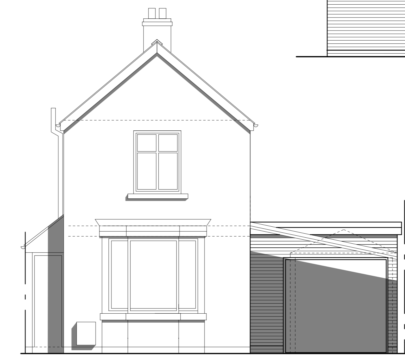
PROPOSED FRONT VIEW