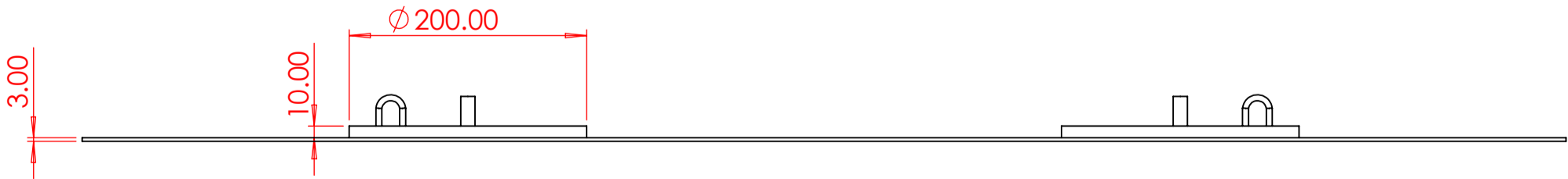
PLAN SCALE 1:5