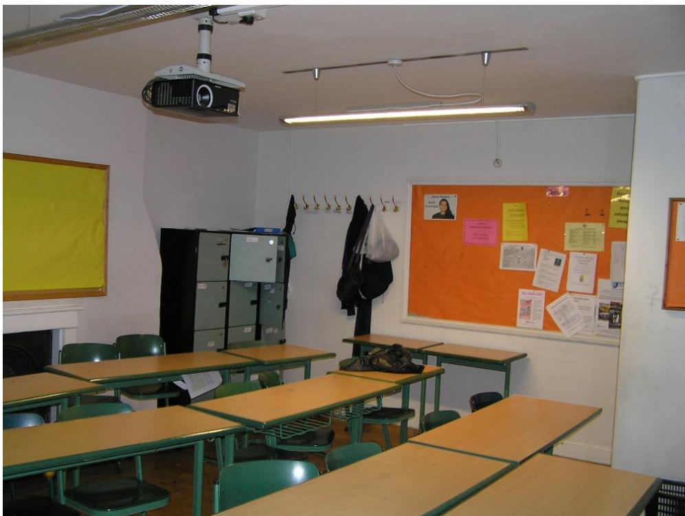
P5. Room 26 before 2016 works.