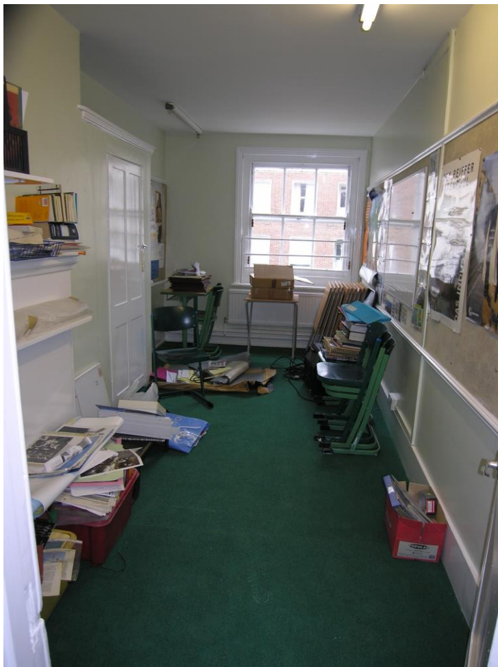
P13. Room 21 in 2007.