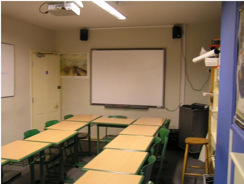
P8. Room 27 before 2016 works.

Rooms 26 and 27 now called room 31. Photographs of rooms some years before 2016 works taken. Continued.