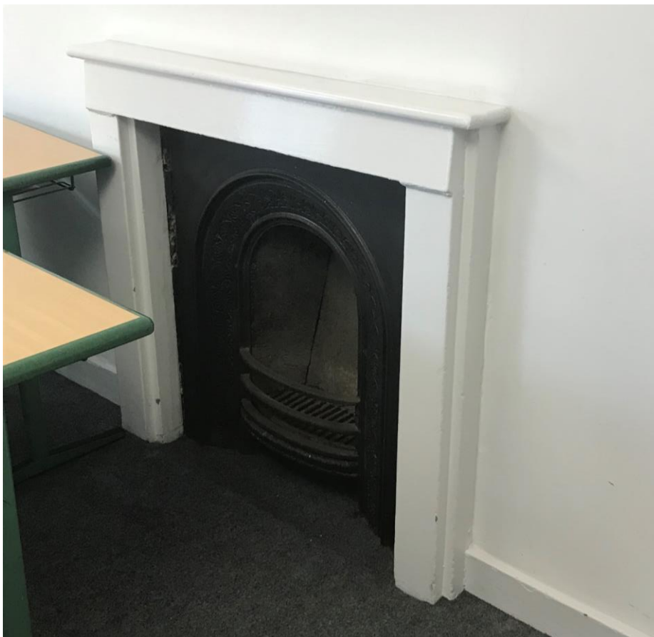
P9. Fireplace room 31 at south side.