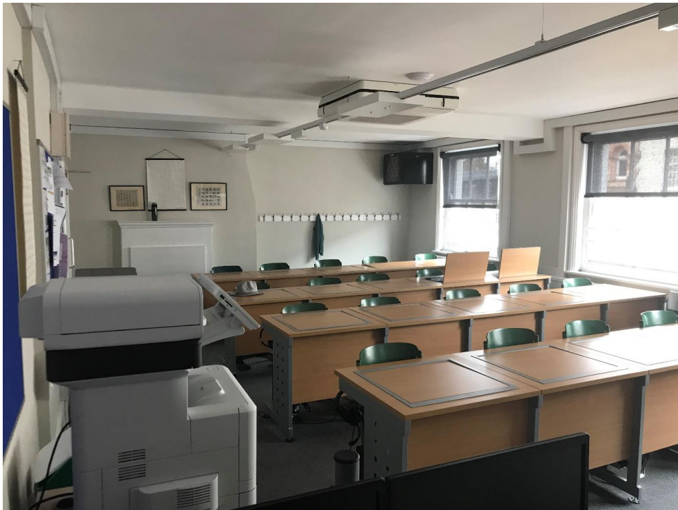
P16. Room 32 in July 2021.