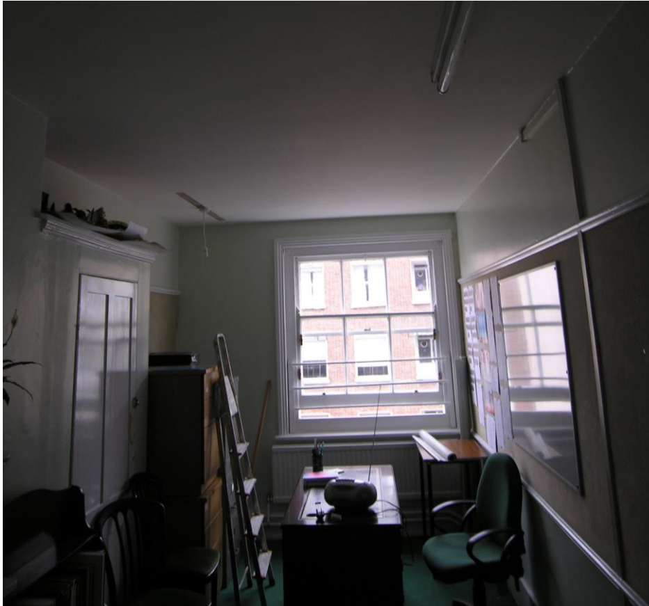
P14. Room 21 in 2009.

Room 20 and 21 in 2007 and one of 21 in 2009. Continued.