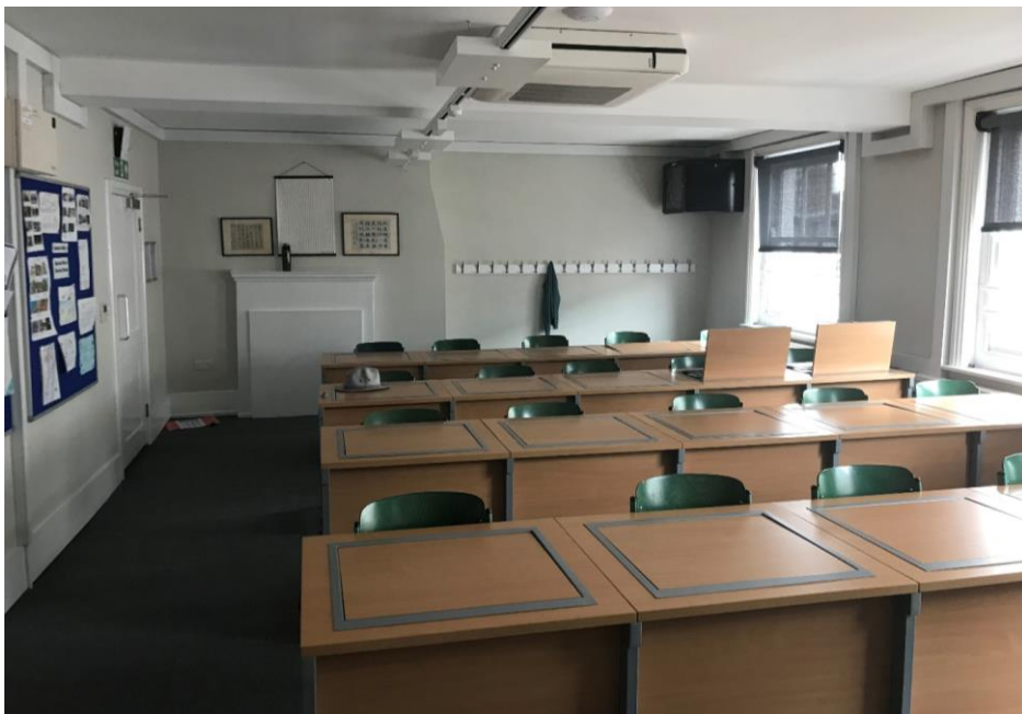
P15. Room 32 July 2021.