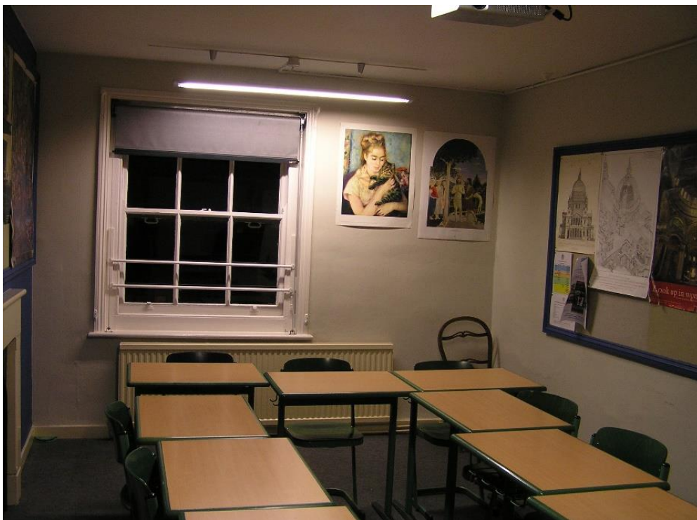
P7. Room 27 before 2016 works.