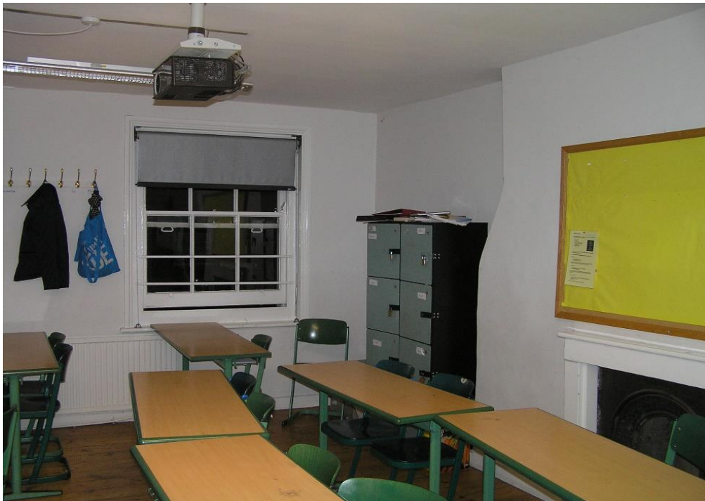
P6. Room 26 before 2016 works.

Rooms 26 and 27 now called room 31. Photographs of rooms some years before 2016 works taken. Continued.