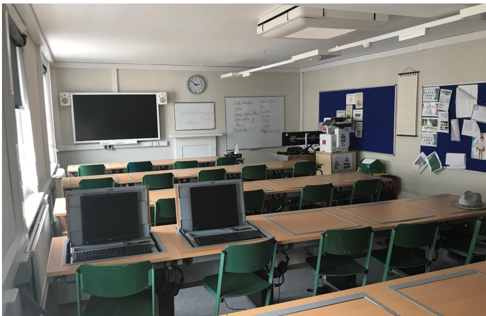
P17. Room 32 in July 2021.