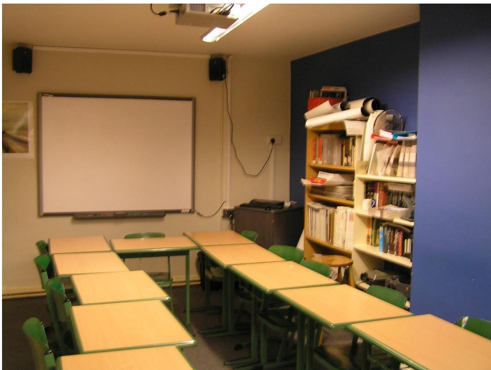
P9. Room 27 before 2016 works.