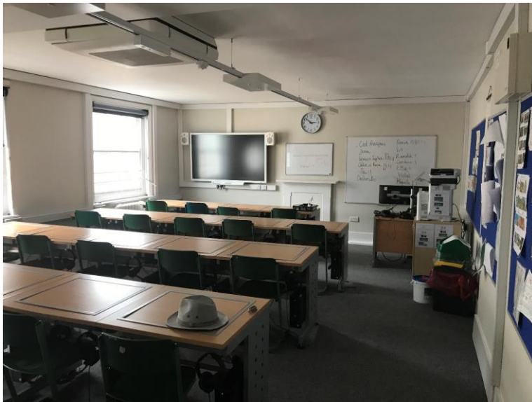
P18. Room 32 in July 2021.