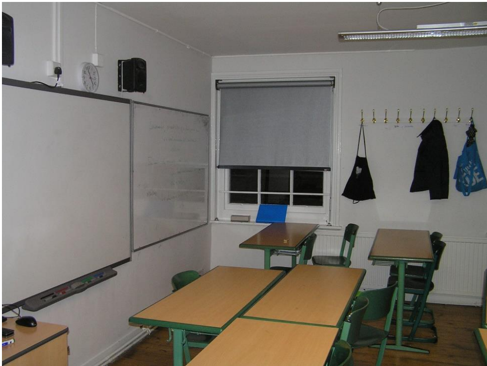
P5. Room 26 before 2016 works.