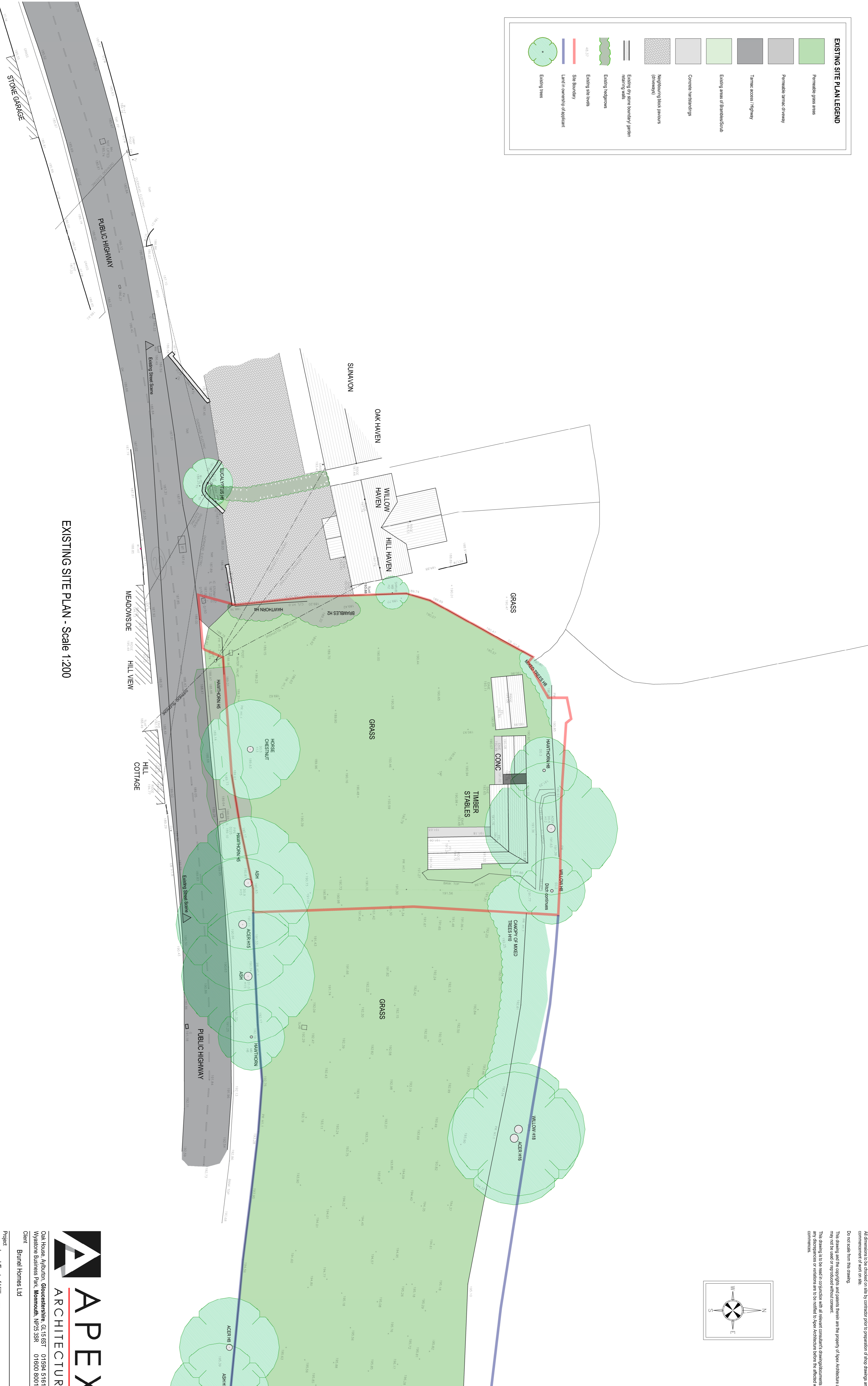
EXISTING SITE PLAN - Scale 1:200

Do not scale from this drawing This drawing and the copyright and patents herein are the property of Apex Architecture and may not be used or reproduced without consent. This drawing is to be used in conjunction with all relevant consultants' drawings/conditions and any discrepancies or variations are to be notified to Apex Architecture before the affected work commences.