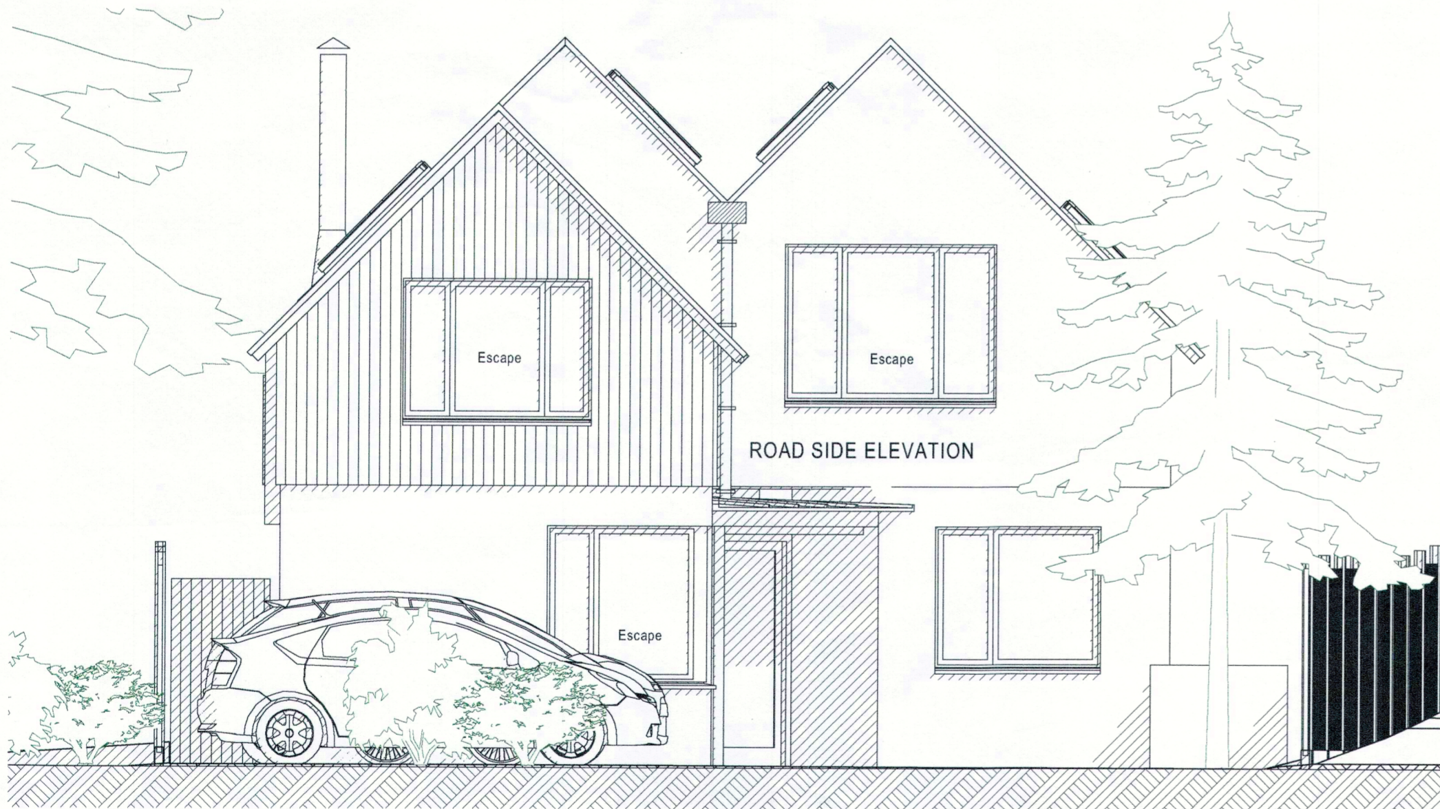
SOUTH - FRONT ELEVATION