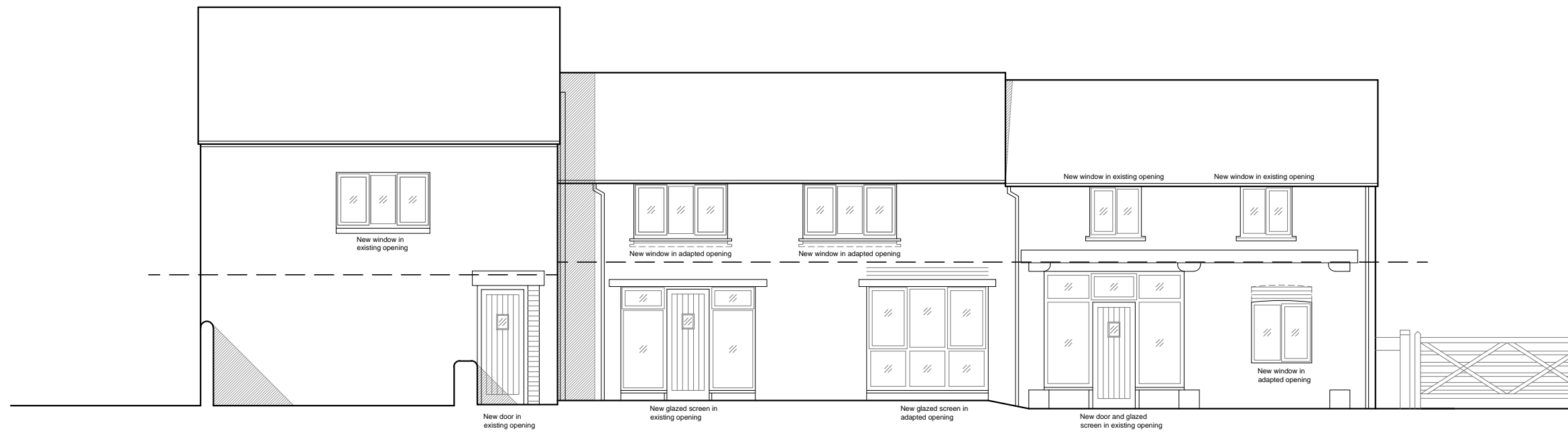
PROPOSED BARN ELEVATION A

This drawing must be read in conjunction with all other MHL, consultants, subcontractors and other consultants drawings together with any specifications and other contract documents