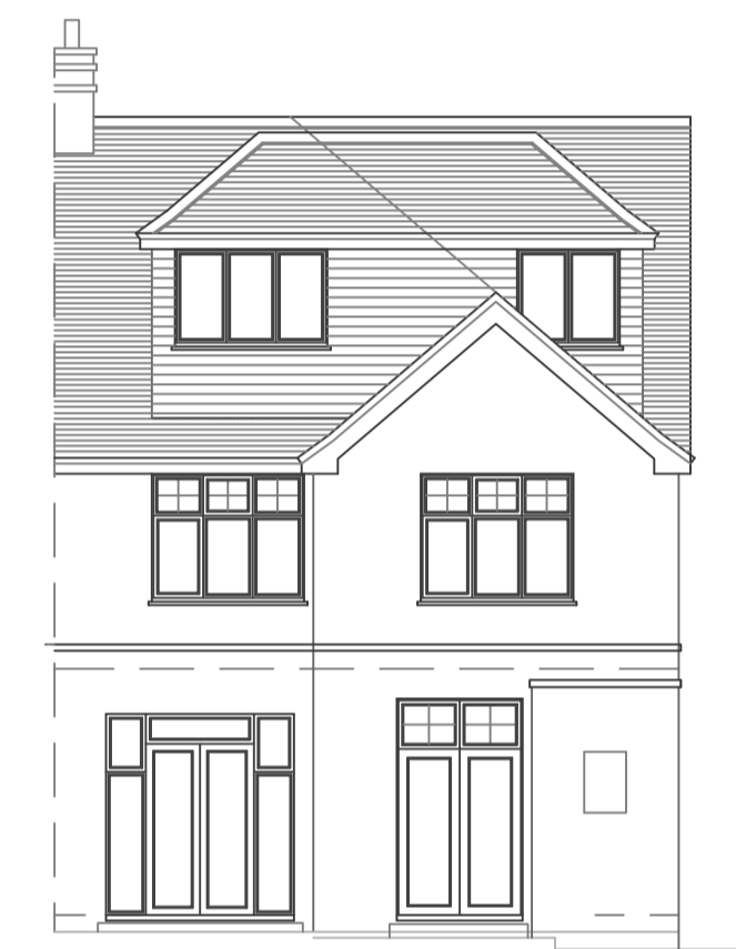
Rear Elevation as Proposed