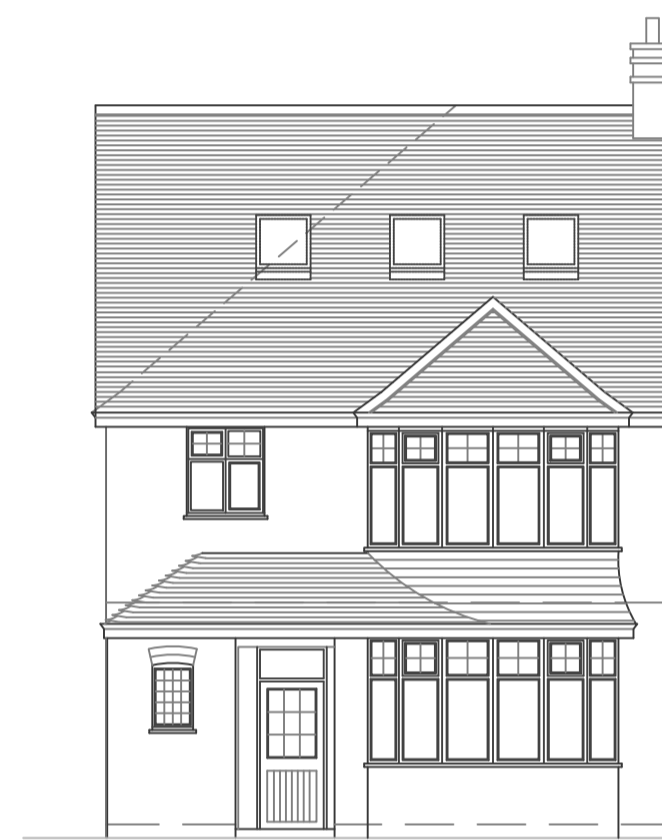
Front Elevation as Proposed

CHECK ALL DIMENSIONS ON SITE BEFORE ANY WORK IS COMMENCED. ALL GOODS MATERIALS AND WORKMANSHIP MUST CONFORM WITH CURRENT BUILDING REGULATIONS, BRITISH STANDARDS AND CODES OF PRACTICE.