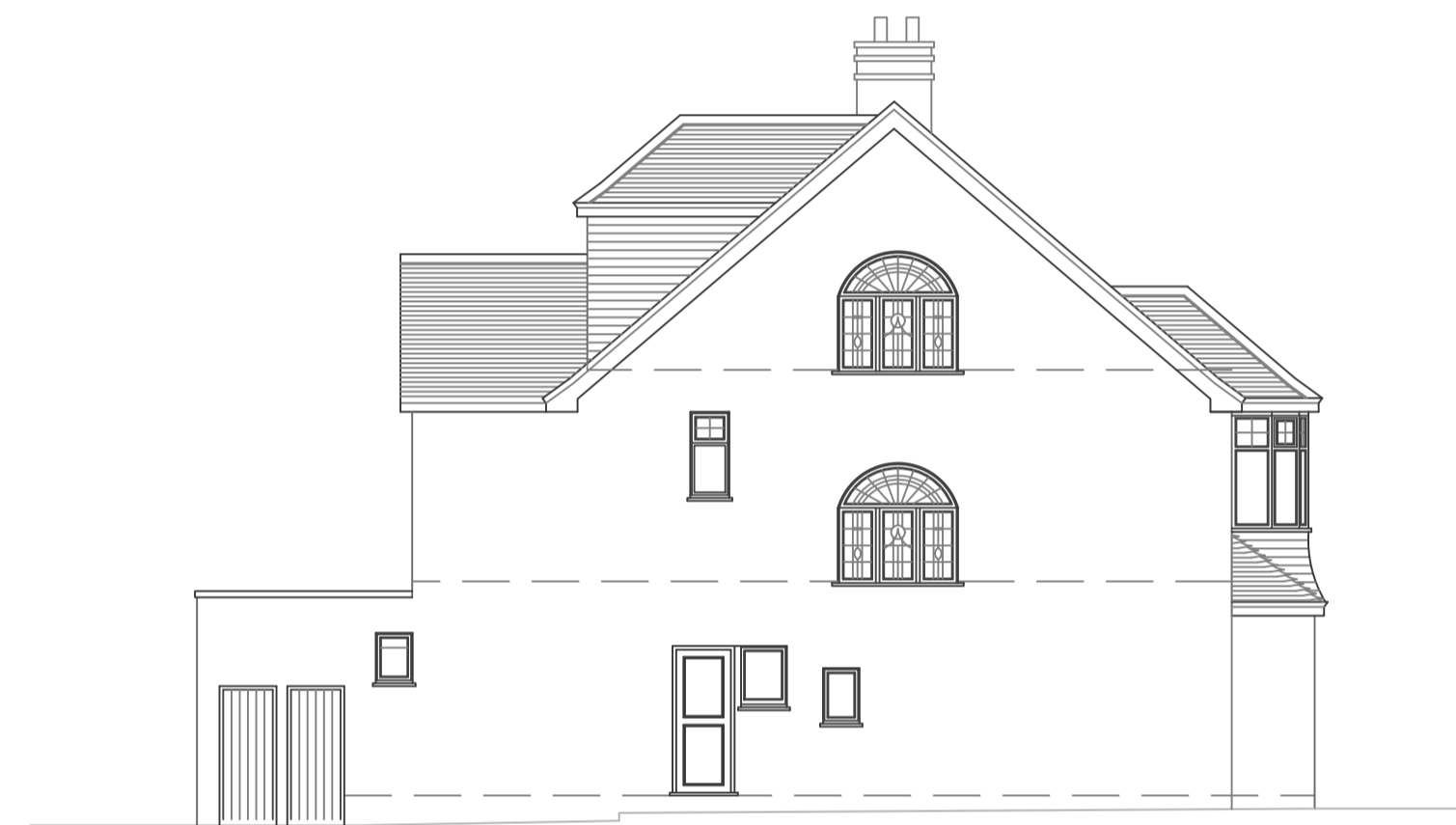
Side Elevation as Proposed