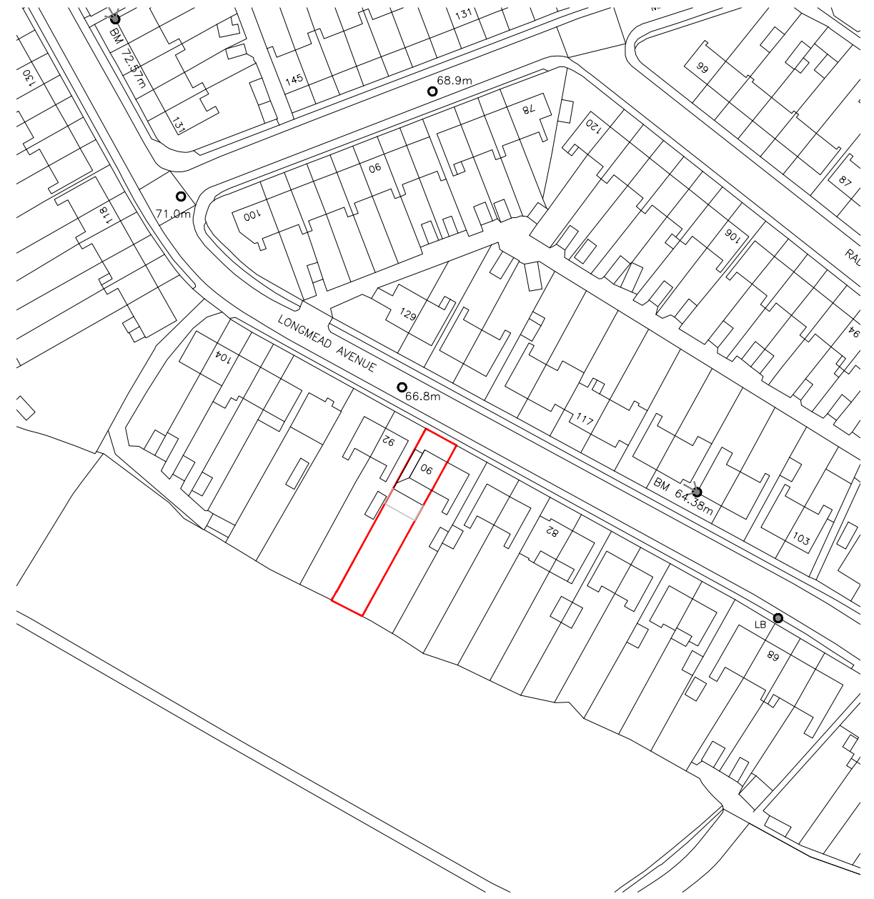
SITE LOCATION PLAN - SCALE 1:1250 @A3