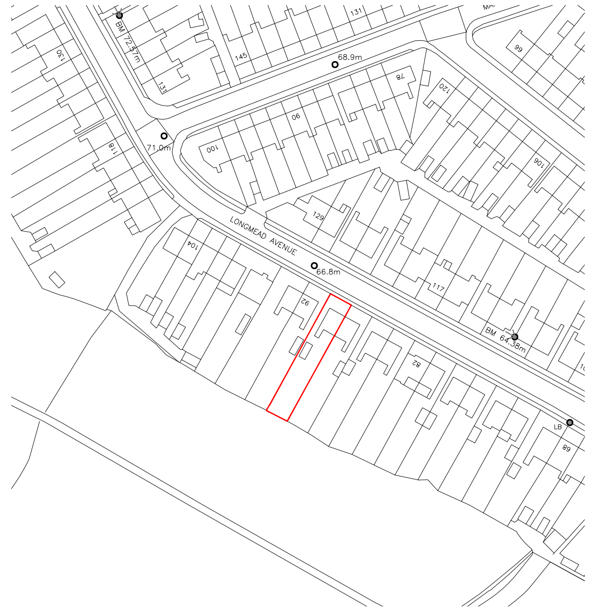
SITE LOCATION PLAN - SCALE 1:1250 @A3