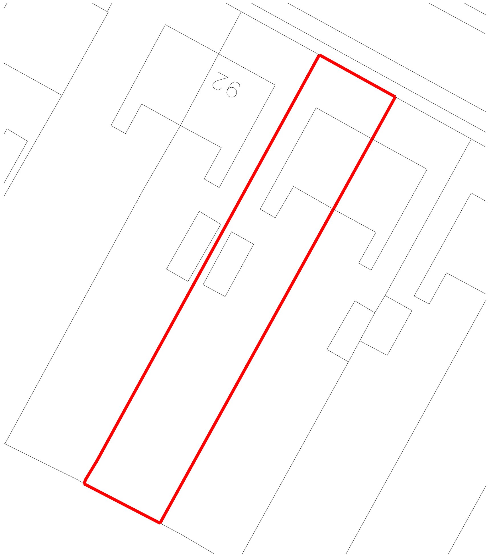
SITE BLOCK PLAN - SCALE 1:200 @A3