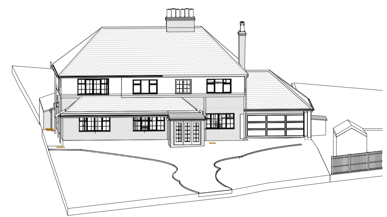
8 Existing 3D Front View