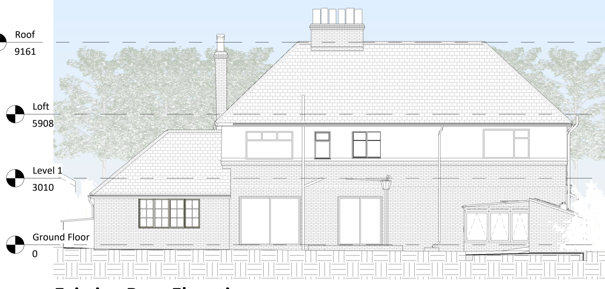
5 Existing Rear Elevation 1 : 100