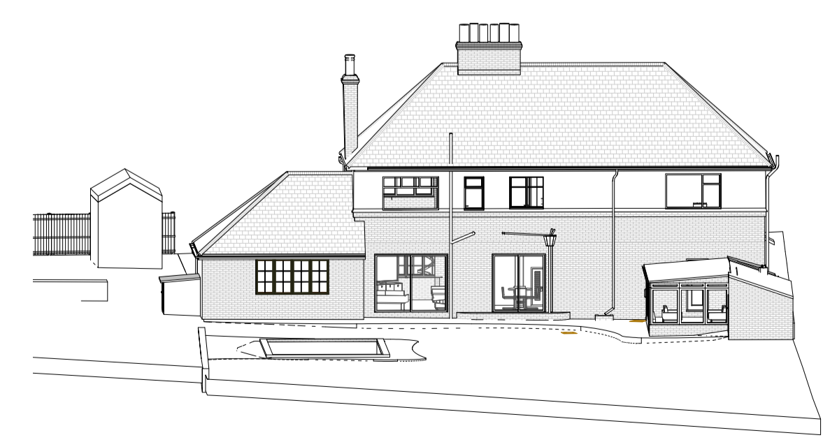
9 Existing 3D Rear View