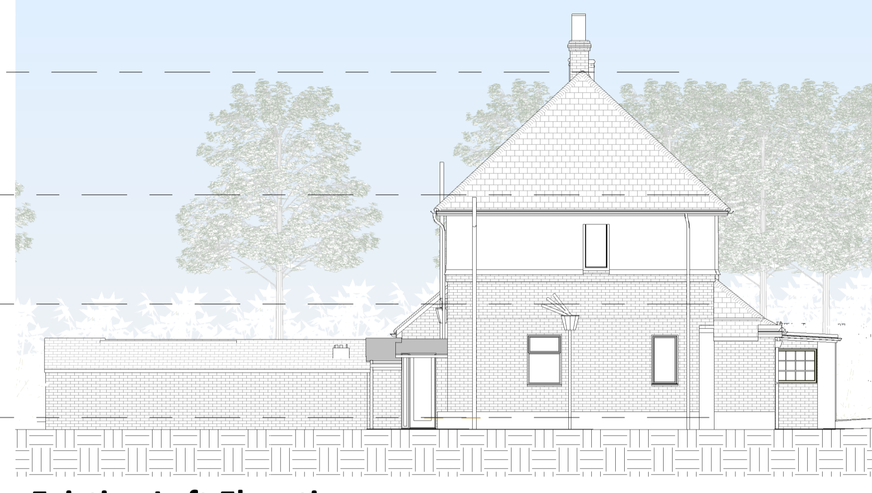
6 Existing Left Elevation 1 : 100