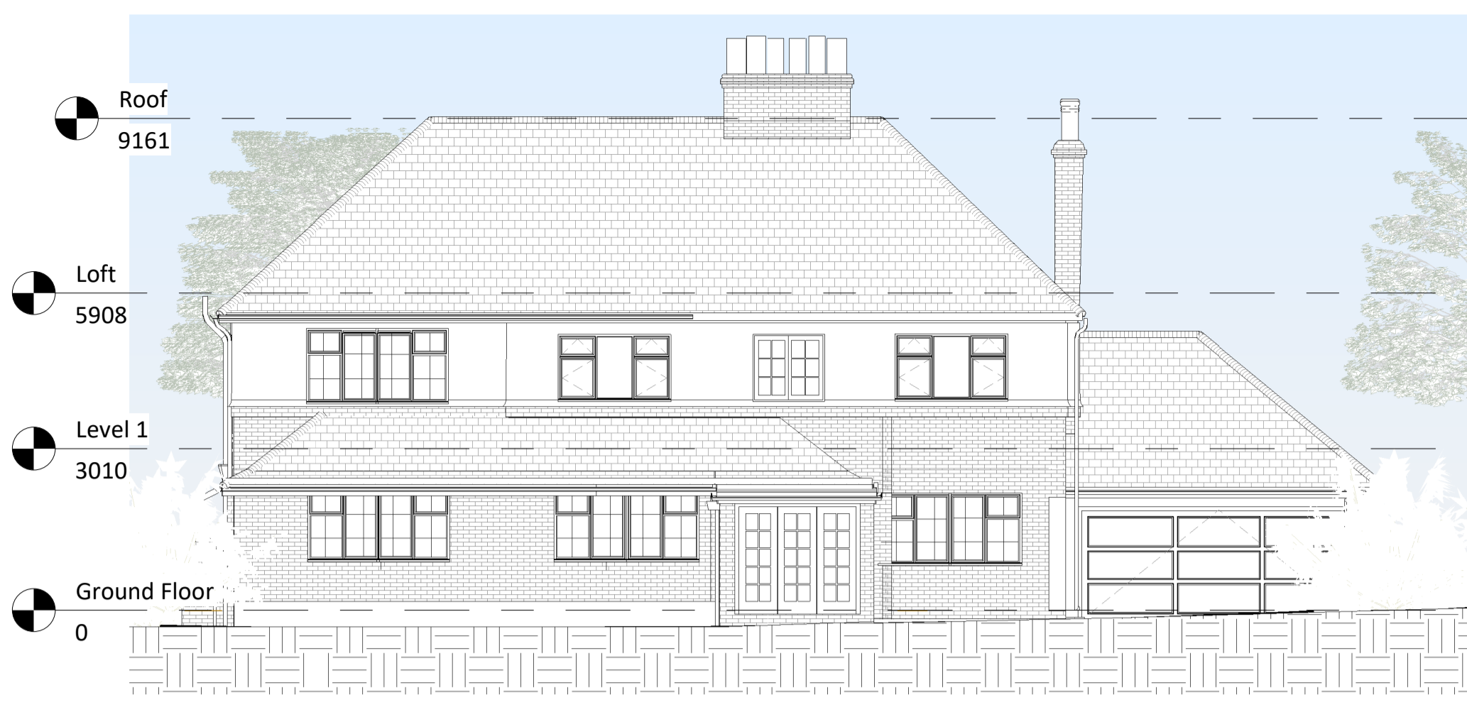
3 Existing Front Elevation 1 : 100