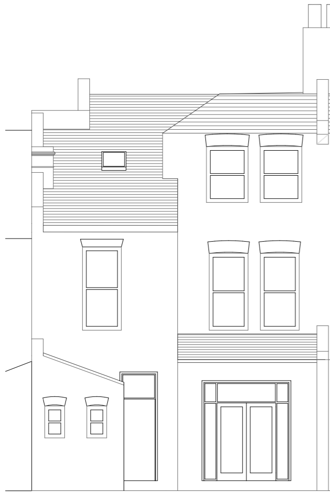
EXISTING REAR ELEVATION SCALE: 1:100