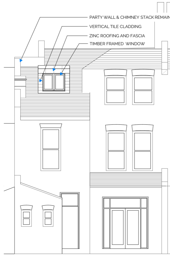
PROPOSED REAR ELEVATION SCALE: 1:100