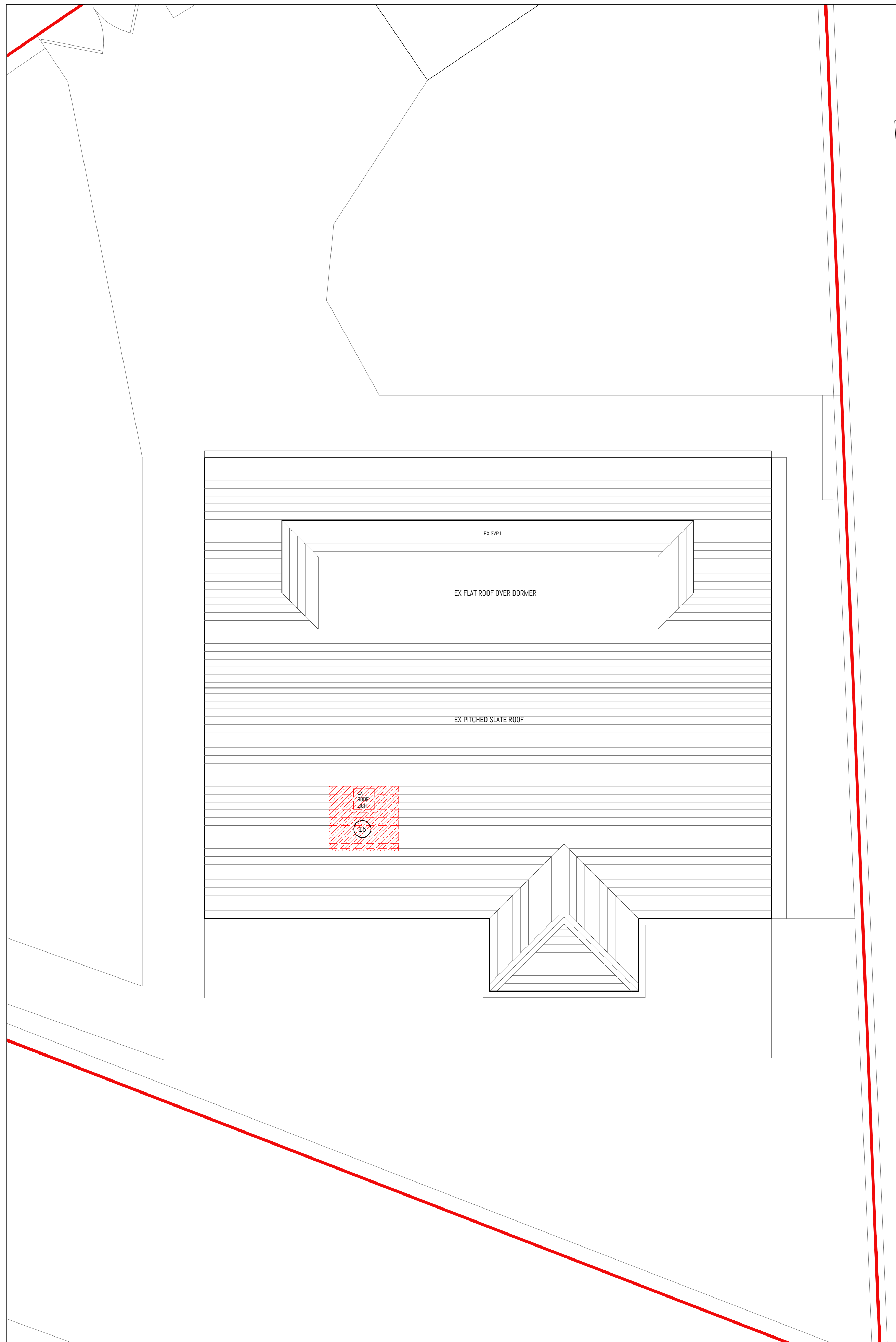
PL-005 1 EXISTING / PLAN / ROOF SCALE 1:50 A1 / 1:100 A3