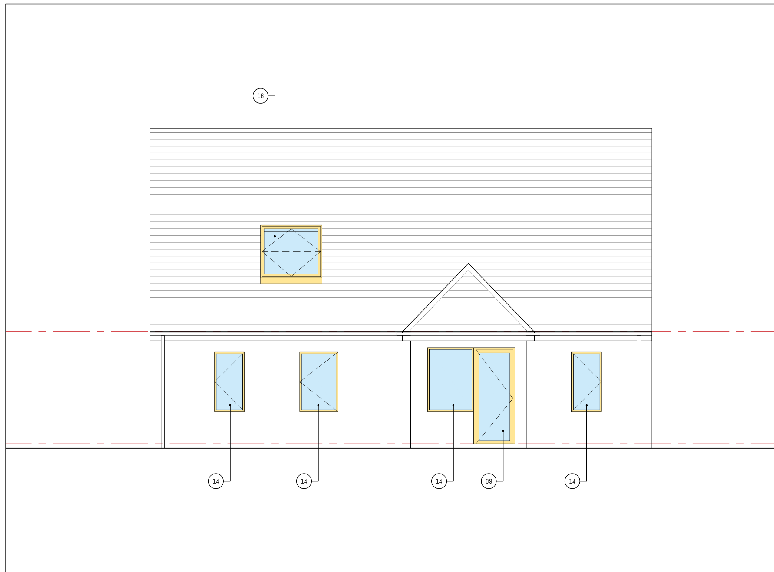
PL-011 2 PROPOSED / ELEVATION / NORTH SCALE 1:50 A3 / 1:100 A3