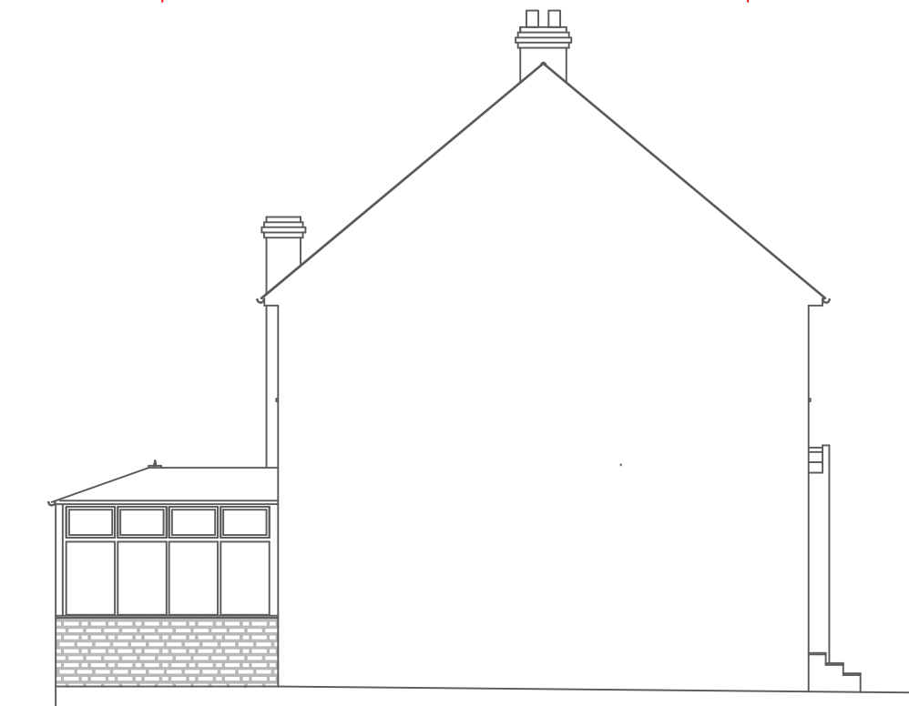
Side Elevation [as viewed from No. 14]