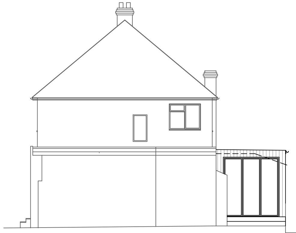
Side Elevation [as viewed from No. 10]