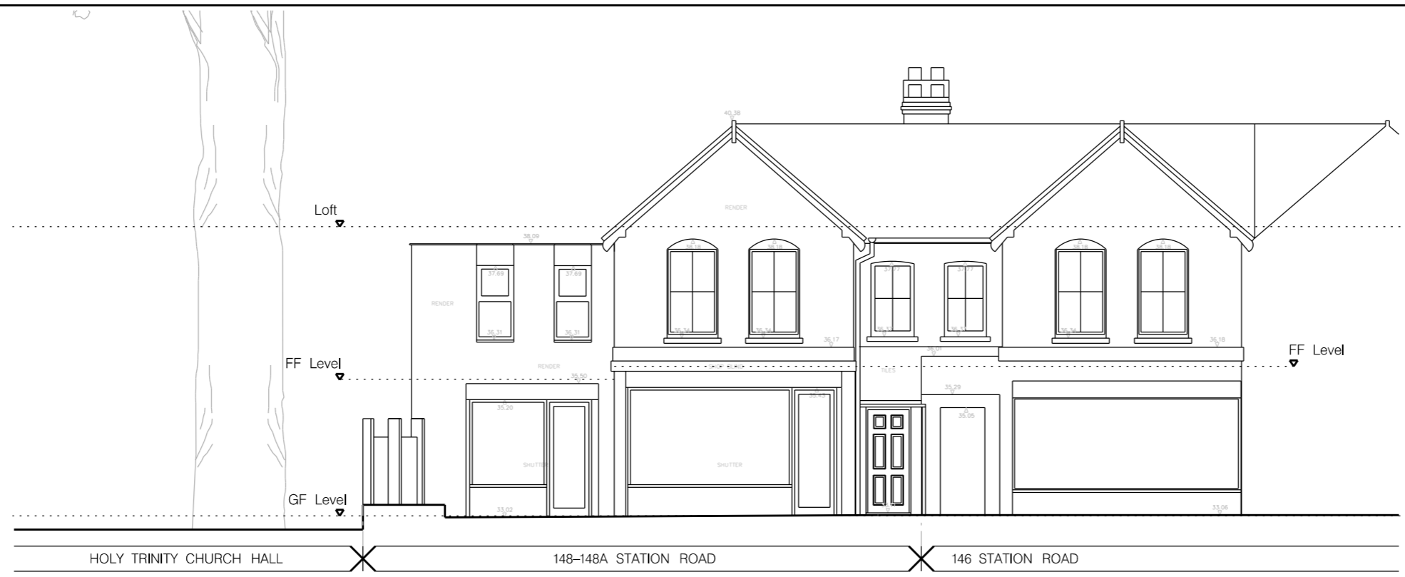
WEST ELEVATION (FRONT)