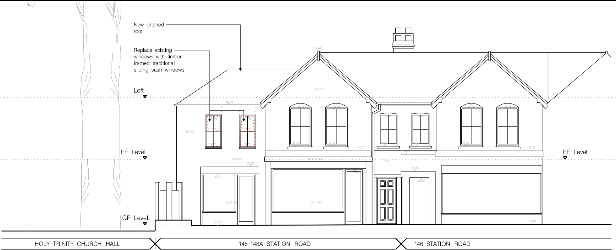
WEST ELEVATION (FRONT)