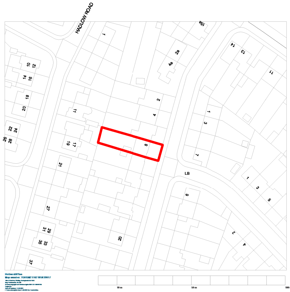
1 LOCATION PLAN 1 : 1250