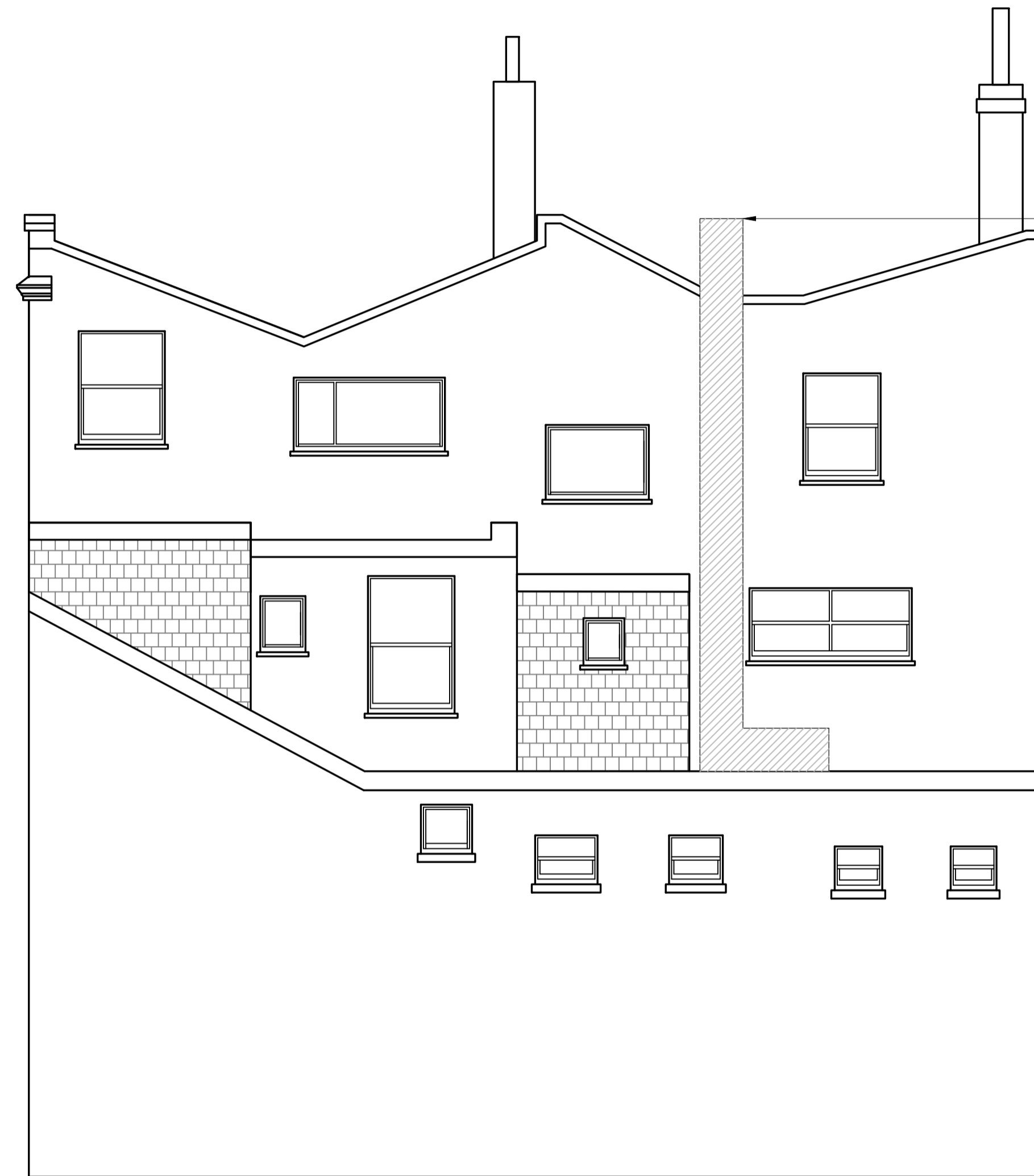
PROPOSED SOUTH ELEVATION Scale 1:50