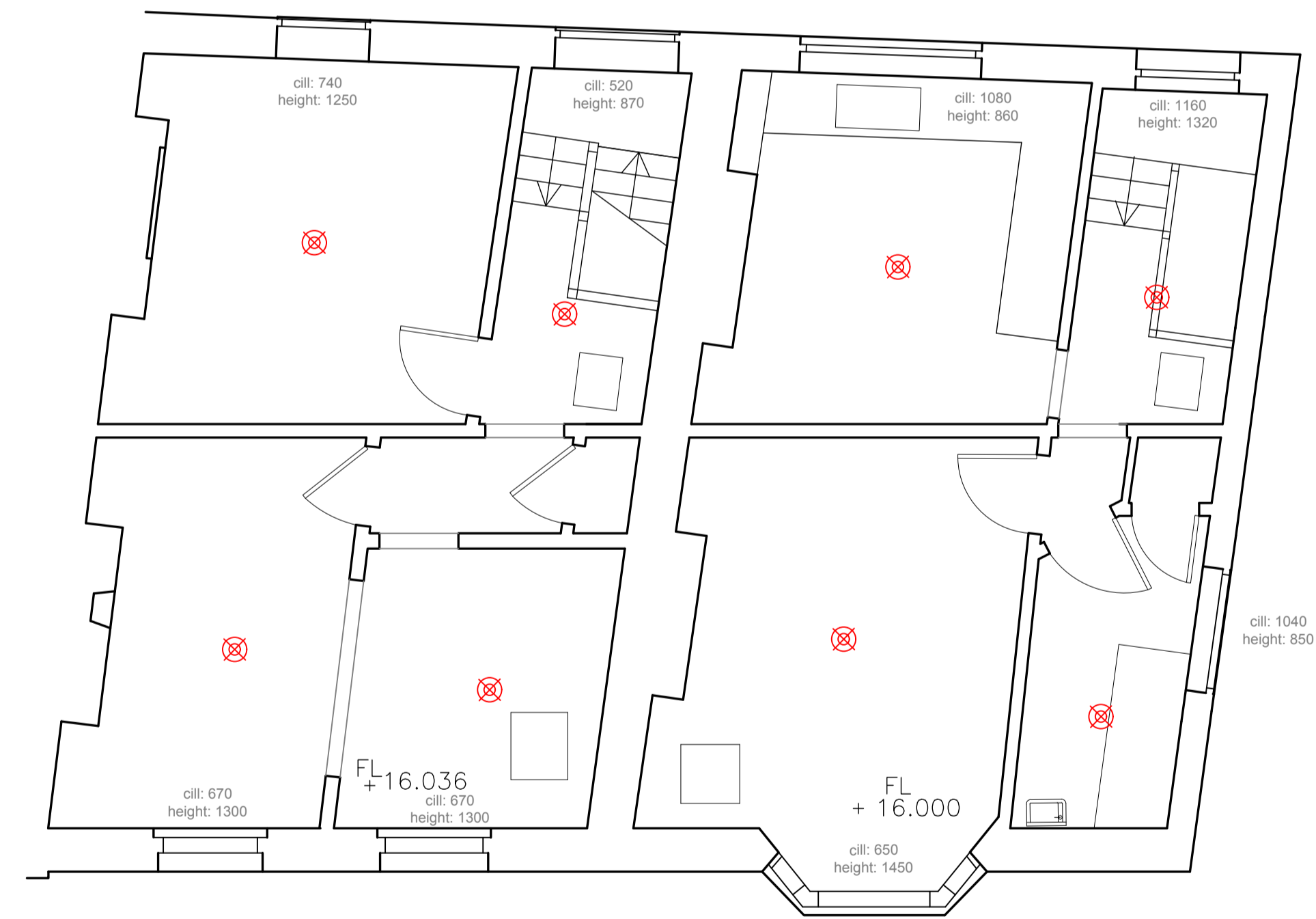
PROPOSED SECOND FLOOR LAYOUT