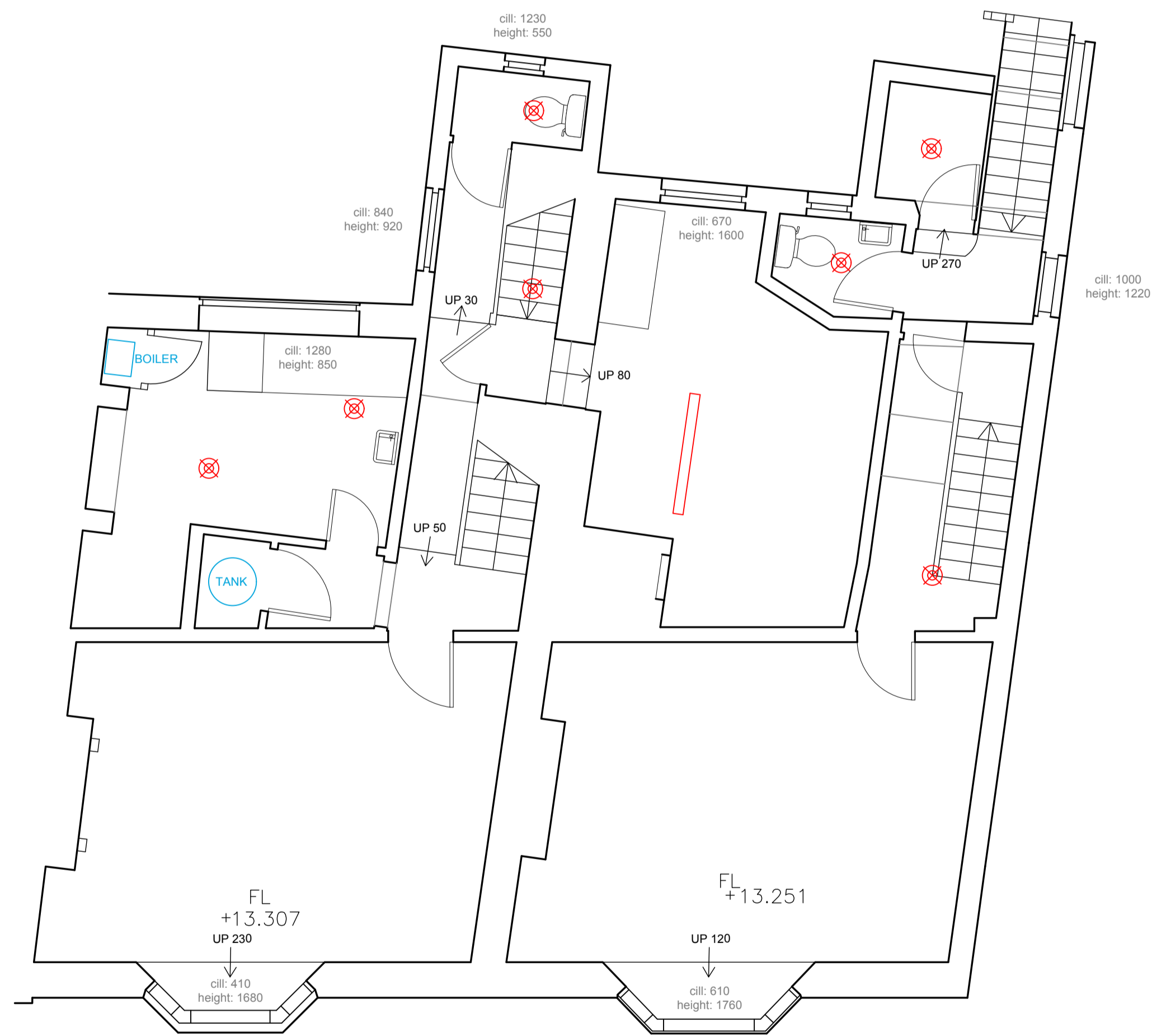
PROPOSED FIRST FLOOR LAYOUT