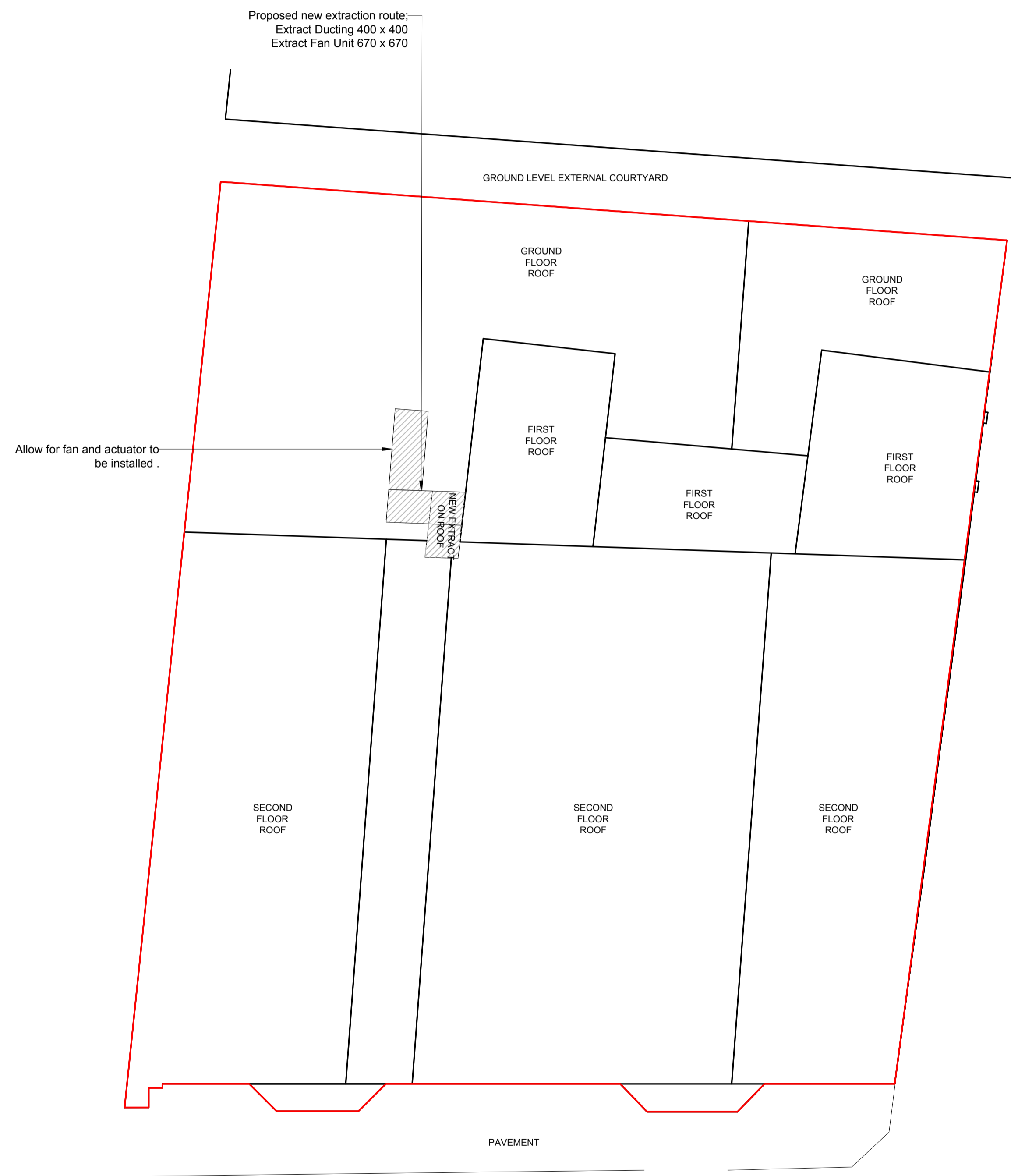
PROPOSED ROOF & SITE PLAN Scale 1:50