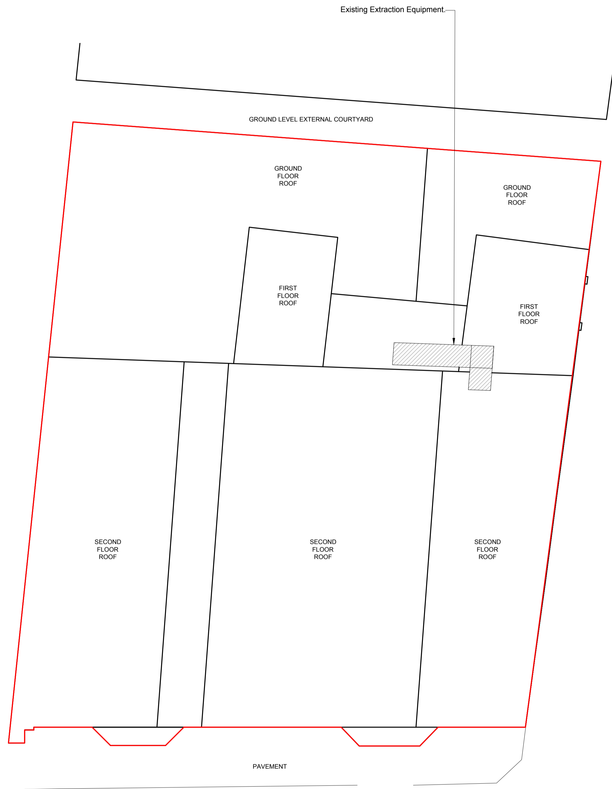
EXISTING ROOF & SITE PLAN Scale 1:50