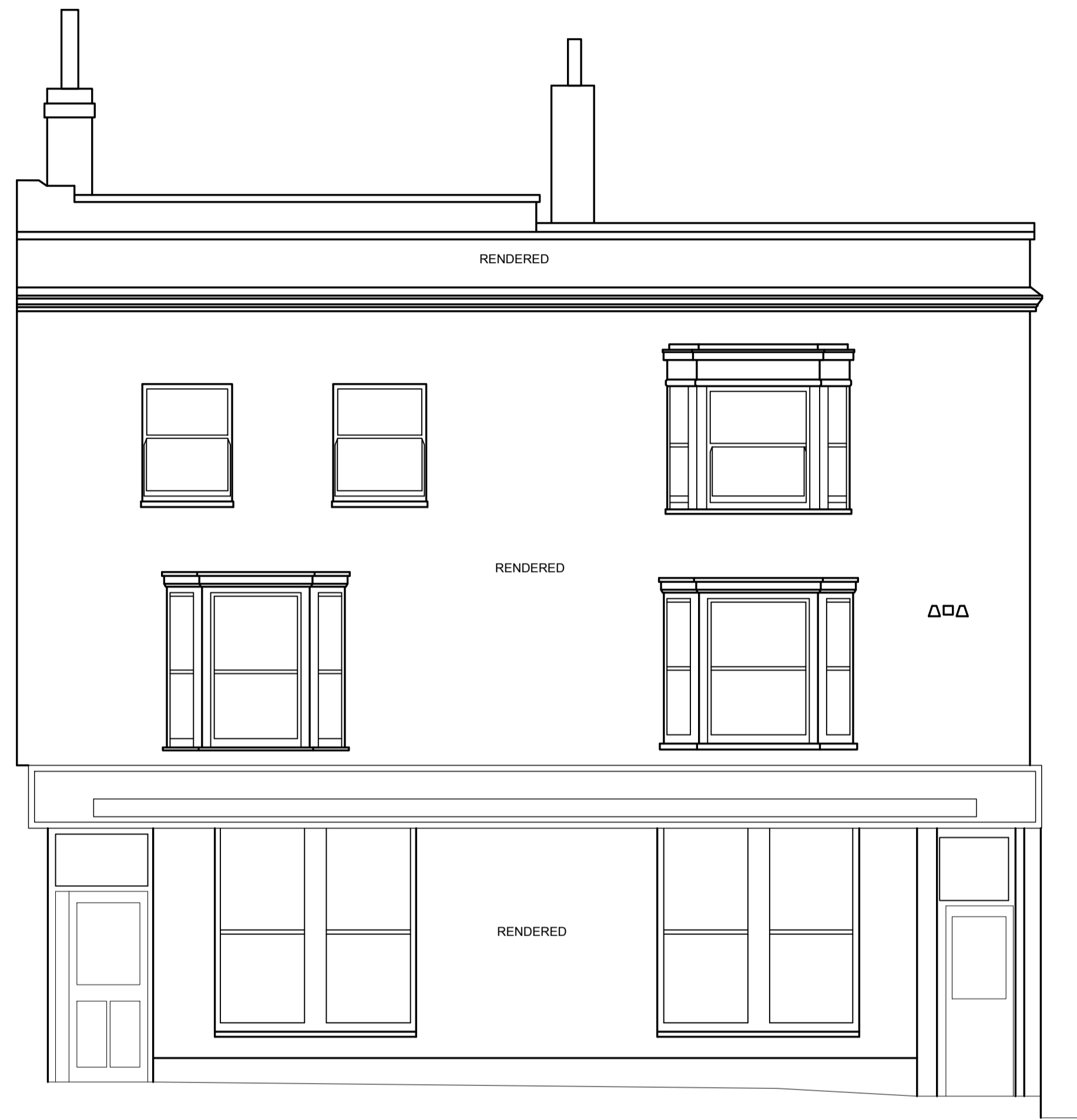
EXISTING NORTH ELEVATION Scale 1:50