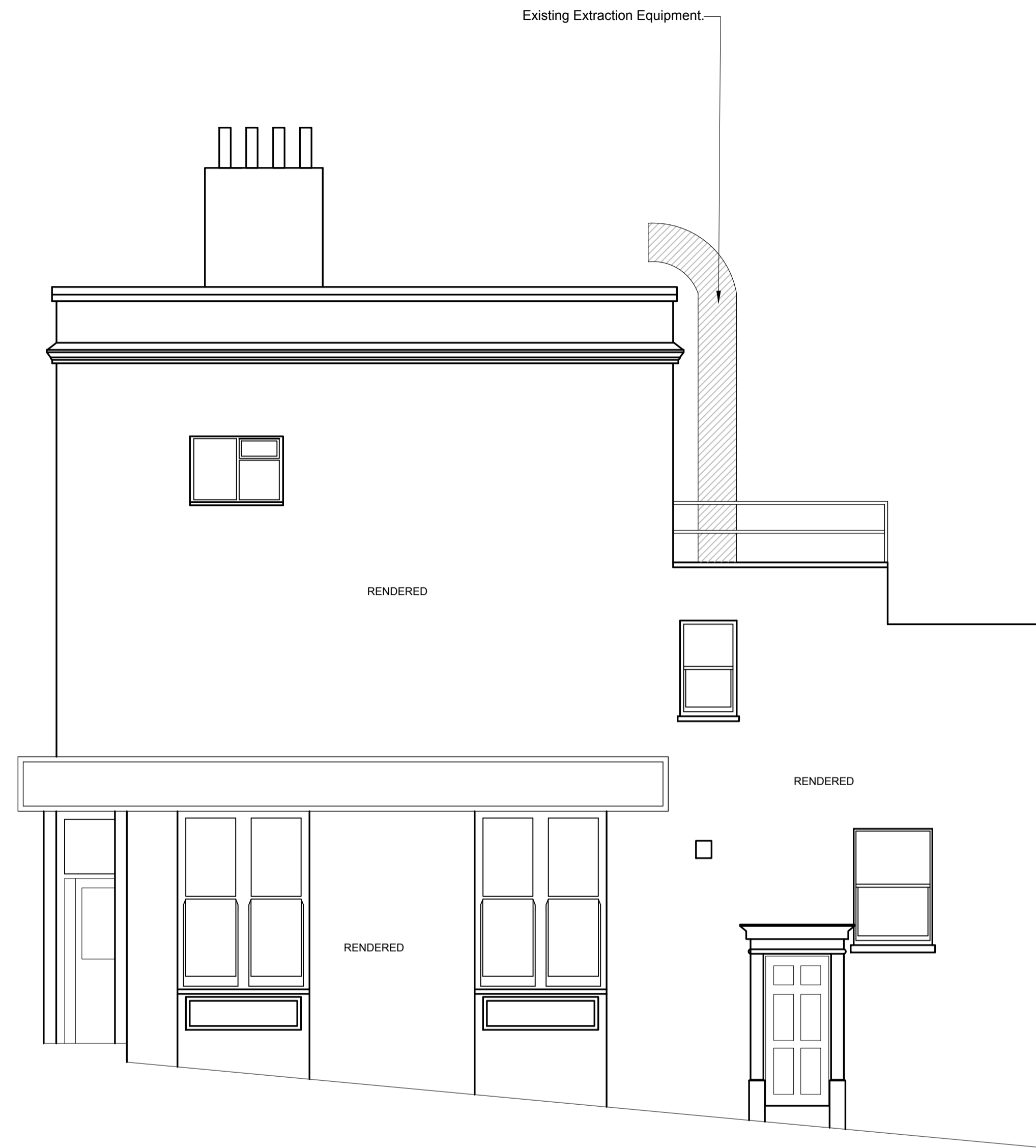
EXISTING WEST ELEVATION Scale 1:50