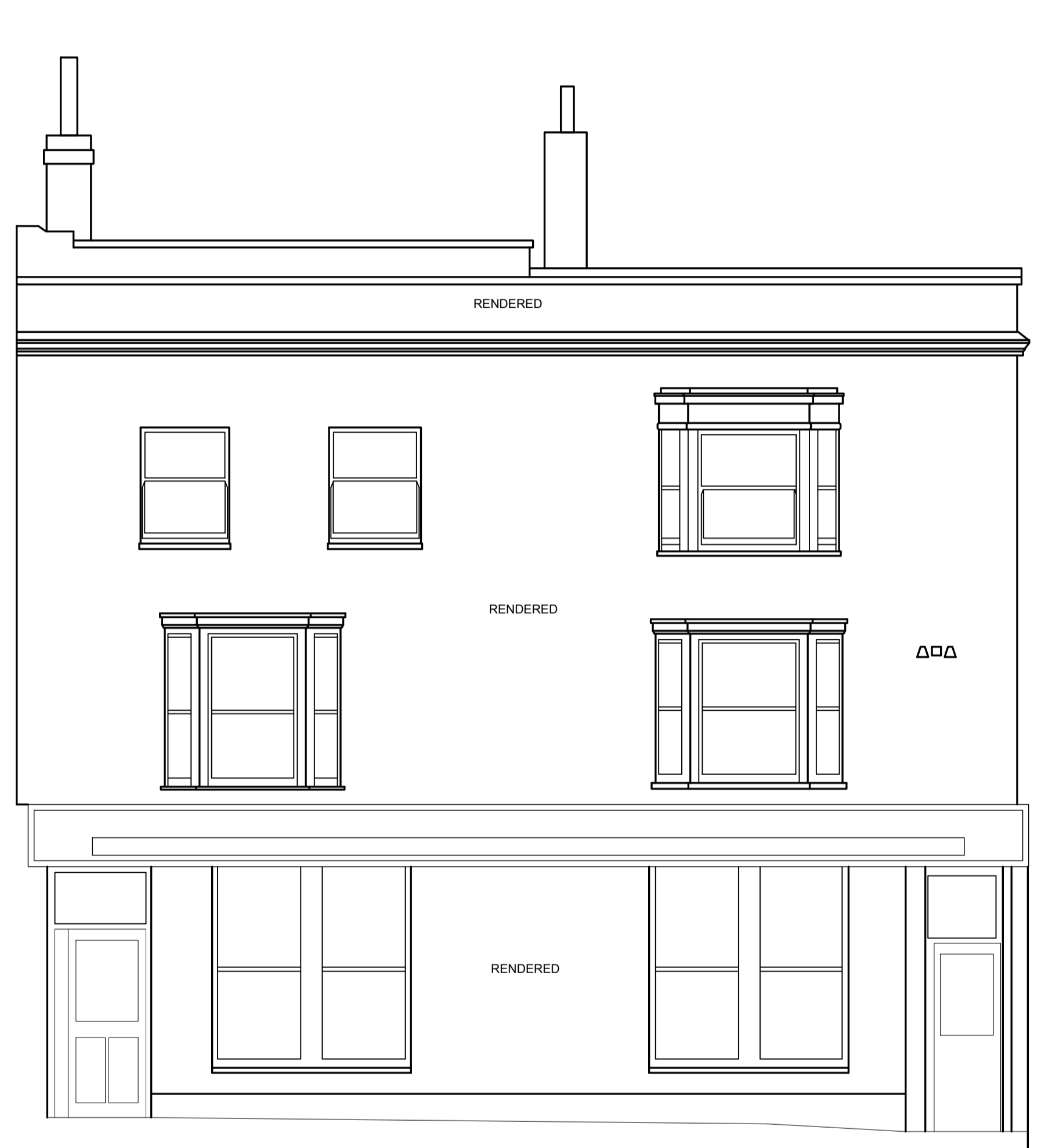
PROPOSED NORTH ELEVATION Scale 1:50

This drawing, design & all information contained herein remains the sole copyright of CONCORDE BGW & reproduction in any form is strictly forbidden unless permission is obtained in writing. NOTES: - All dimensions must be checked on site. The contractor must verify all site dimensions, drawings, details & specifications. Any discrepancies must be reported to CONCORDE BGW prior to any commencement of work. - Figured dimensions to take preference over those scaled. - All specified items are to be installed in accordance with the manufacturers recommendations & instructions. © Copyright