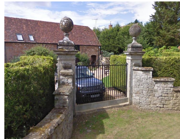
Gate piers to the north of The Millhouse

Although these piers carry a listing it is important to note that they are not original to the site. The piers were purchased from a reclamation yard in the mid 1960's and positioned in front of the barn by a previous owner of the Manor House. As a result the piers are not of real historical significance as they do not accurately reflect the original setting of the site.