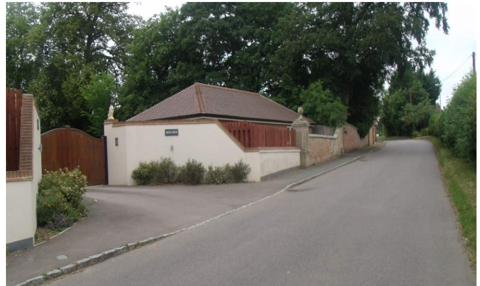
Example further along the road of a garage/annex impacting the setting of the Conservation Area.

As a result the garage is not considered to have a detrimental impact on the significance of the piers or the bridge and the contribution they make to the character and appearance of the Conservation Area.