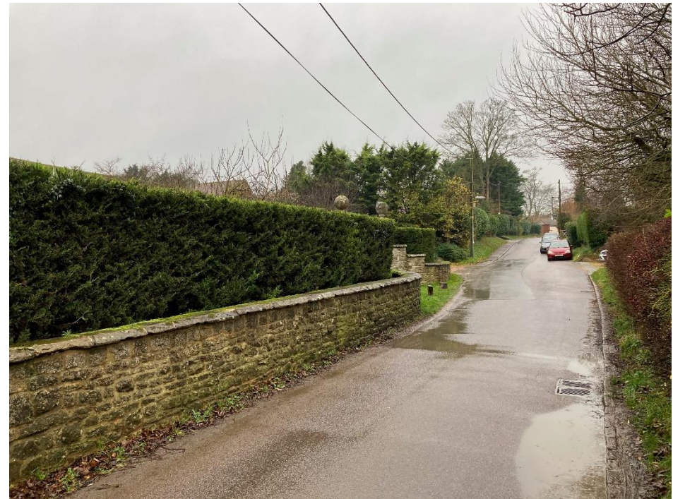
The Garage will sit below the line of the hedge. There will therefore be no impact on this view.

For the reasons set out above the Local Authority should be able to make a positive decision on the application.