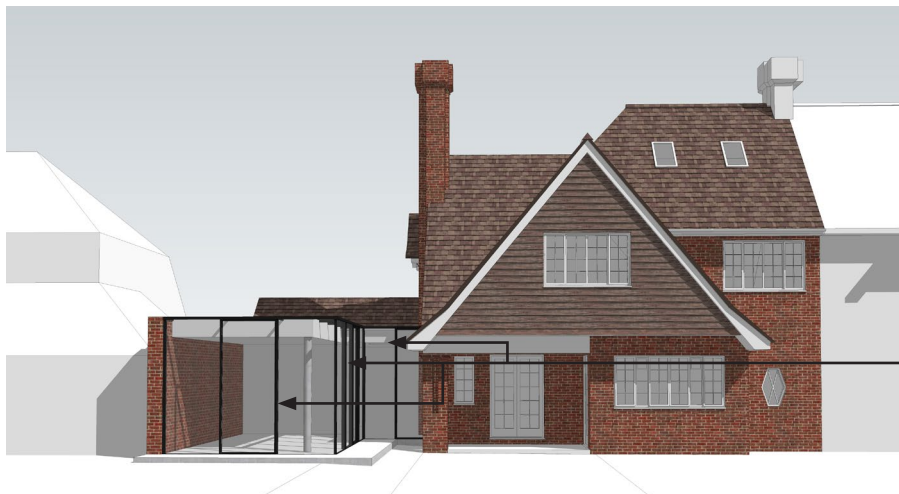
slimline black framed glass locations