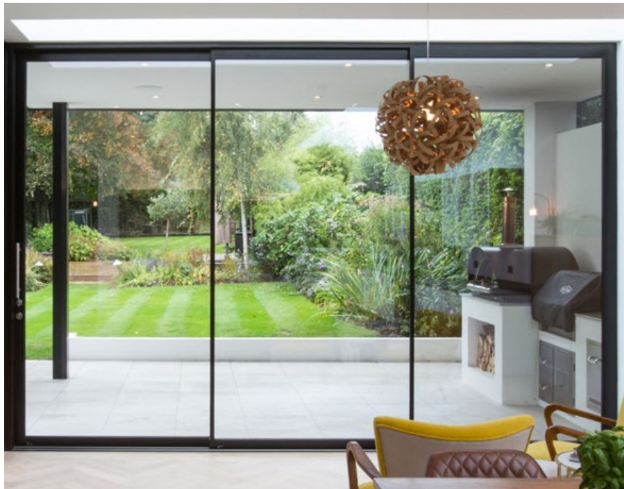
slimline black framed glass example

The glass used will be low E to minimise heat gain and loss, and low iron to ensure it is clear.