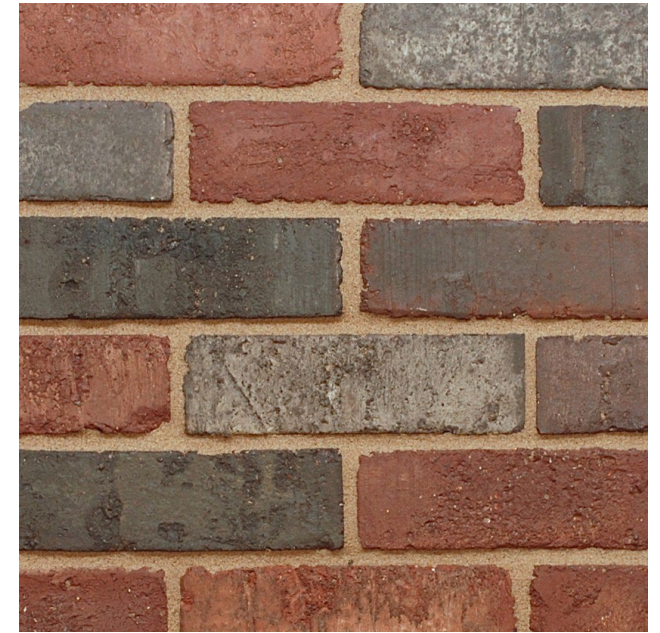
proposed brickwork - Furness Weathered Red Brick