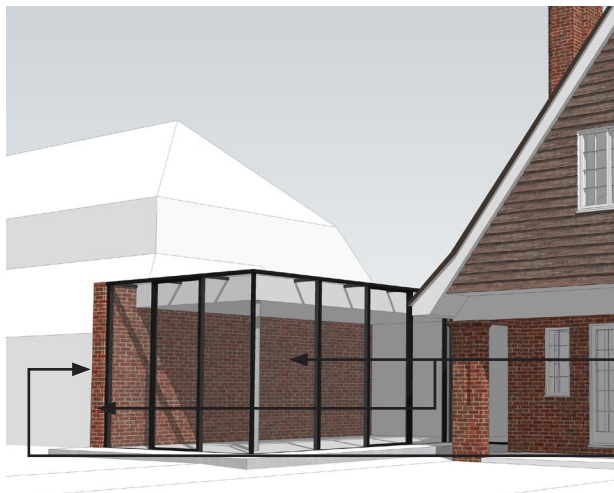
proposed brickwork locations