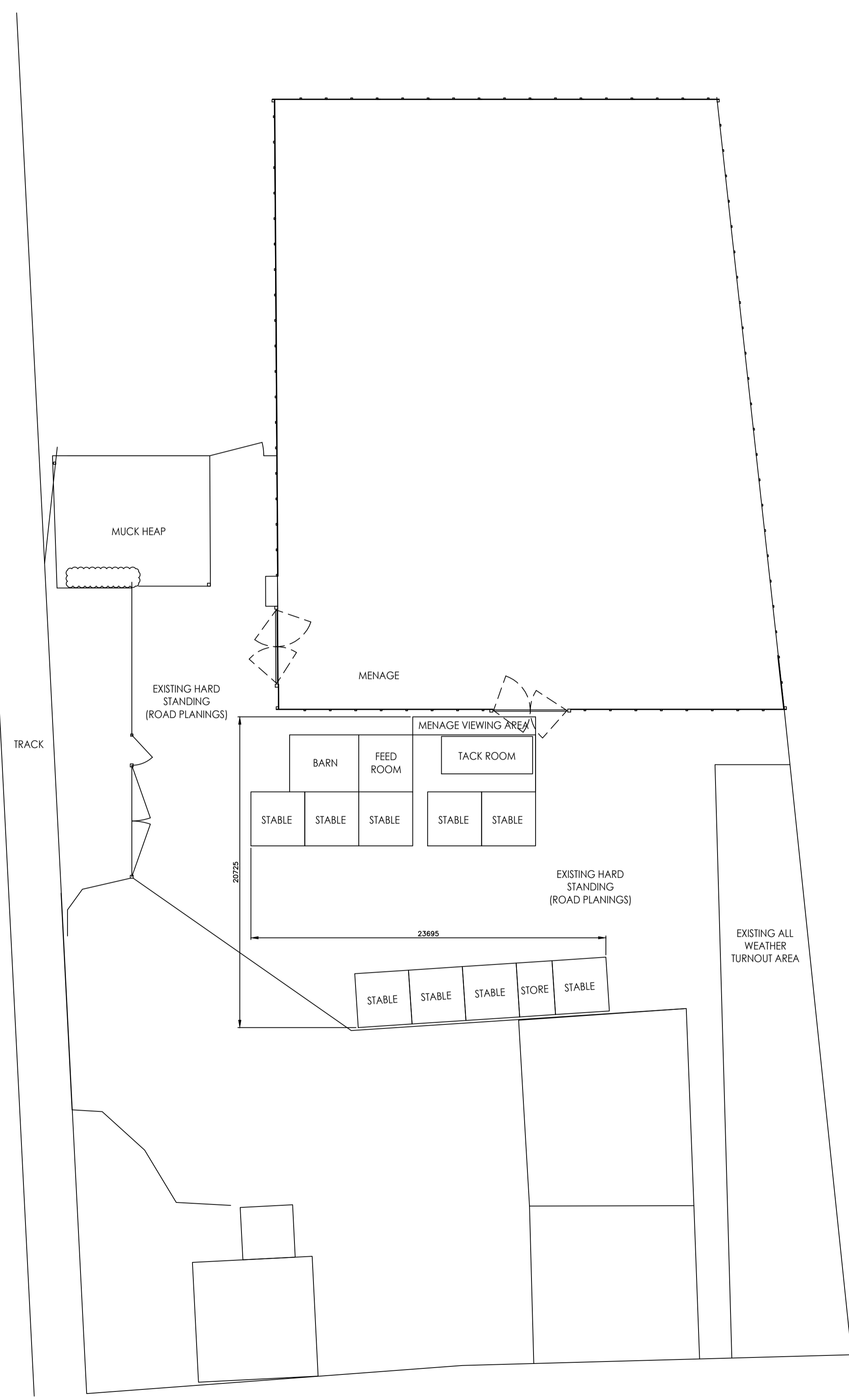
EXISTING PLAN SCALE 1:1200 @ A1