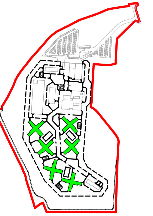
Site Key Plan