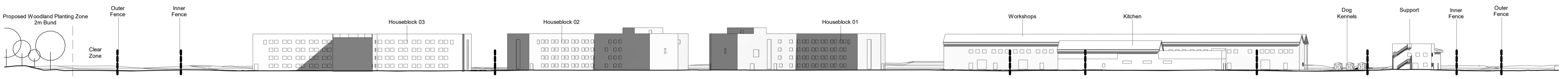
3 Site Section-West Facing 2D View - PLANNING 9401 1: 750