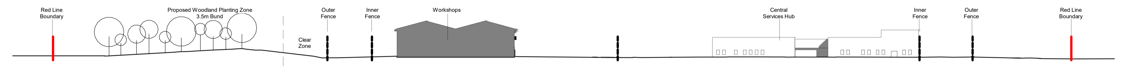
2 Site Section-North Facing 2D View - PLANNING 9401 1: 750