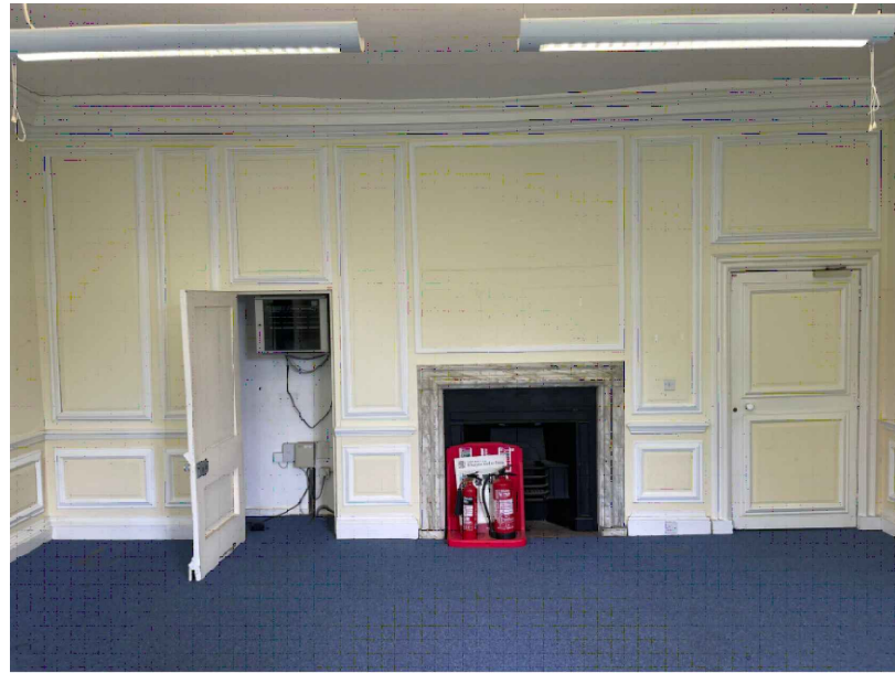
EXISTING OFFICE 5 PHOTOGRAPH