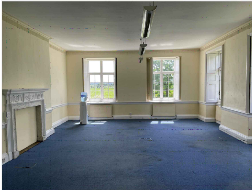
EXISTING OFFICE 4 PHOTOGRAPH