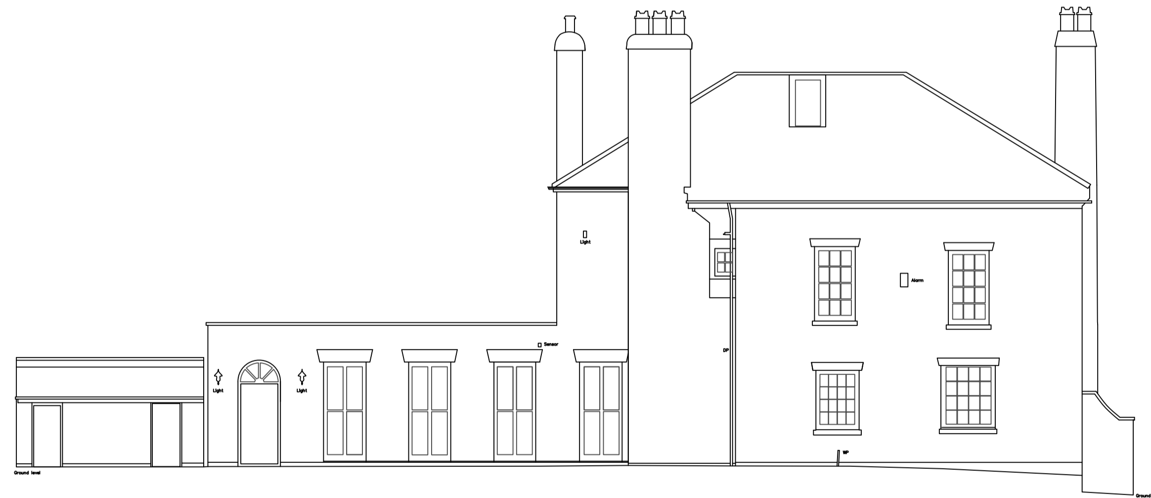
3 - SOUTH WESTERN ELEVATION