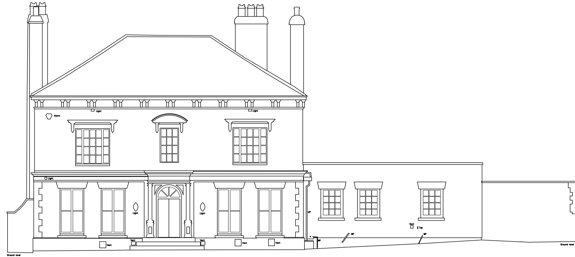
1 - NORTH EASTERN ELEVATION

NOTES: THIS DRAWING, IDEAS AND CONCEPTS ARE COPYRIGHT OF THE JOHNSON AND JOHNSON DESIGN PARTNERSHIP LTD AND NOT TO BE REPRODUCED EXCEPT BY WRITTEN PERMISSION. ALL DIMENSIONS TO BE CHECKED ON SITE AND ANY DISCREPANCIES AND ADJUSTMENTS TO BE NOTED AND PASSED TO THE CA FOR FURTHER INSTRUCTIONS. DO NOT SCALE DRAWING, IF IN DOUBT ASK.