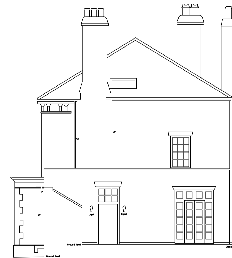
4 - SOUTH EASTERN ELEVATION