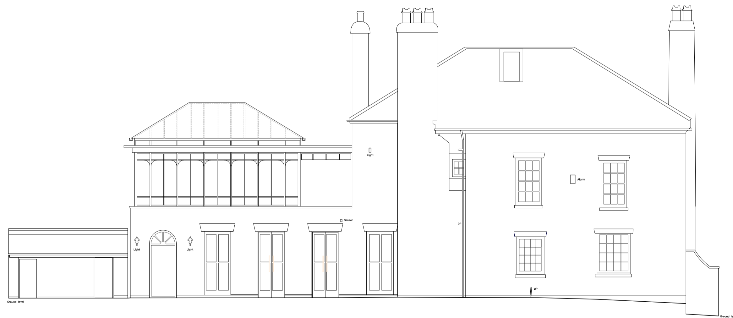
3 - SOUTH WESTERN ELEVATION