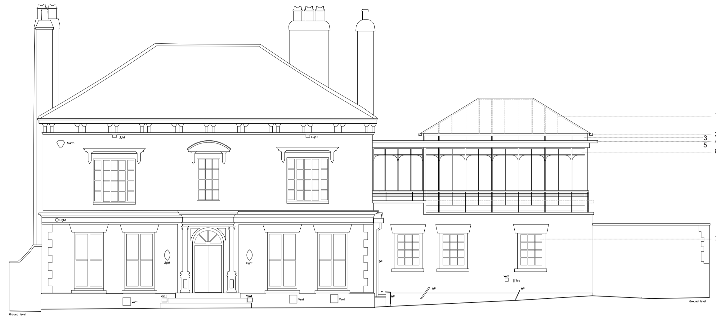
1 - NORTH EASTERN ELEVATION

NOTES: THIS DRAWING, IDEAS AND CONCEPTS ARE COPYRIGHT OF THE JOHNSON AND JOHNSON DESIGN PARTNERSHIP LTD AND NOT TO BE REPRODUCED EXCEPT BY WRITTEN PERMISSION. ALL DIMENSIONS TO BE CHECKED ON SITE AND ANY DISCREPANCIES AND ADJUSTMENTS TO BE NOTED AND PASSED TO THE CA FOR FURTHER INSTRUCTIONS. DO NOT SCALE DRAWING, IF IN DOUBT ASK.