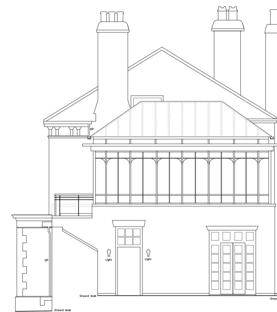
4 - SOUTH EASTERN ELEVATION