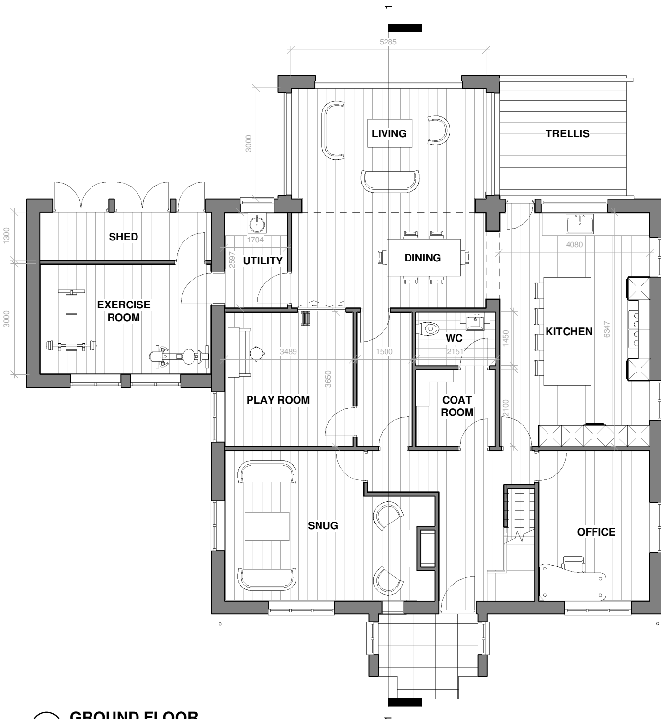
1 GROUND FLOOR 1 : 100