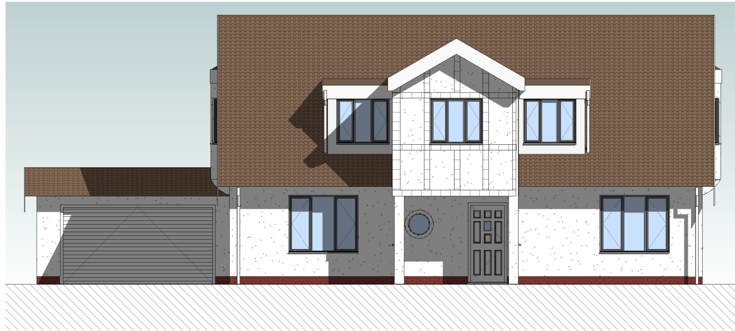
1 FRONT ELEVATION - EXISTING 1 : 100

Do not scale from drawings. All dimensions are in millimetres unless otherwise stated. All dimensions to be verified on site before proceeding with the work. Any discrepancies to be notified in writing to Architect immediately