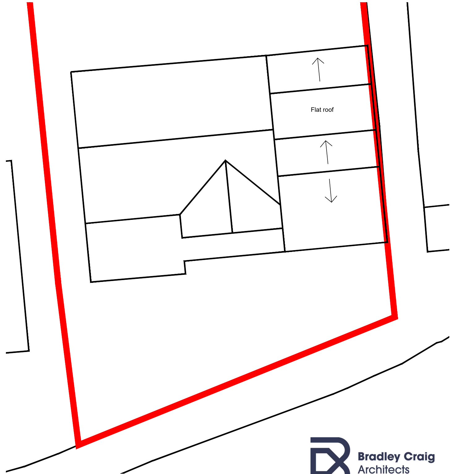
Proposed Roof Plan Scale 1:100 at A3