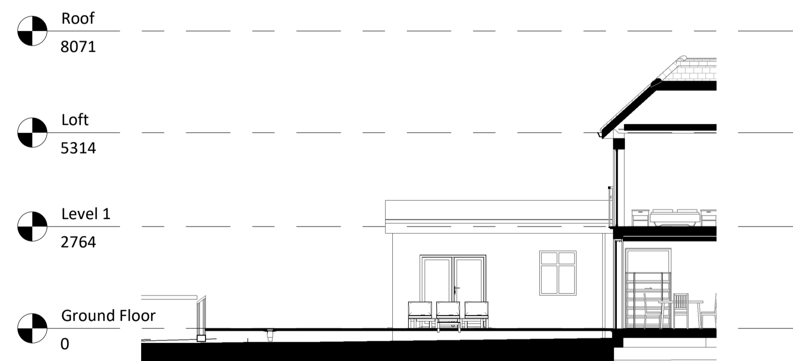
4 Proposed Concealed RHS Elevation 1 : 100