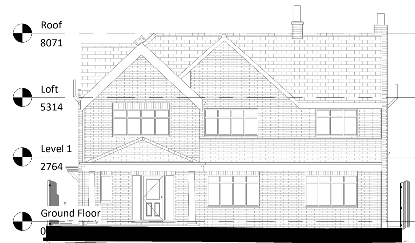
1 Proposed Front Elevation 1 : 100