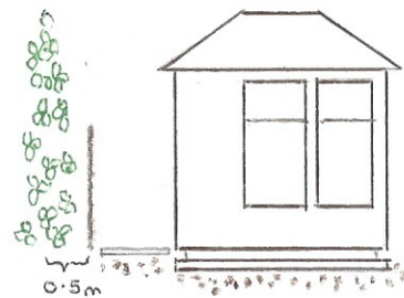
proposed north elevation

Cedar roof and walls from sustainable source Toughened glass opening fanlights