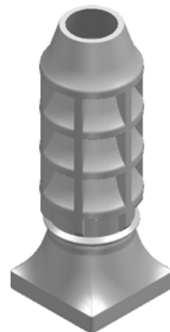
ISOMETRIC VIEW 1:20

WTK DATE (DDMMYY) WTK EN13502 CE 330/SQ 280/SQ 920/HT