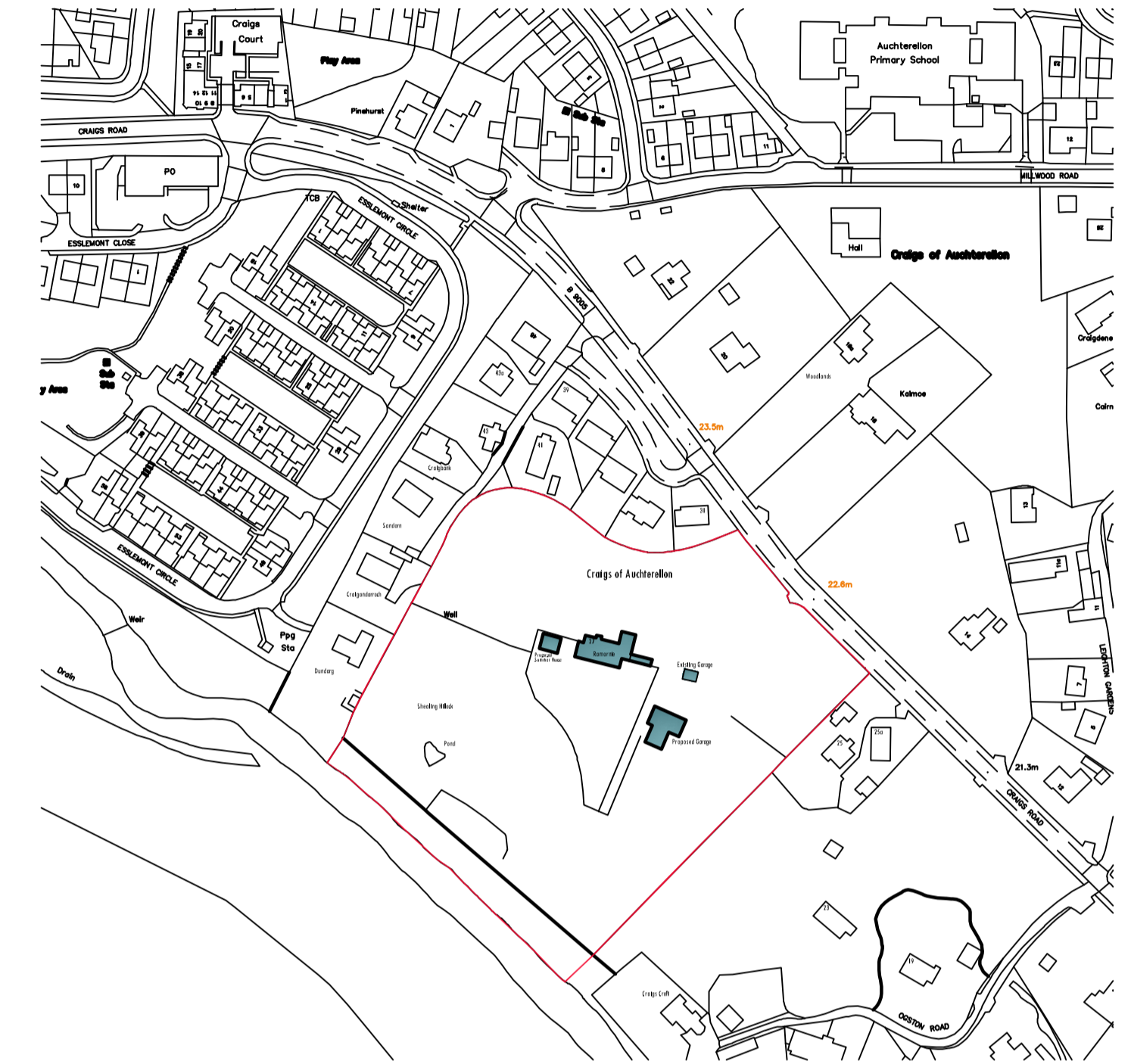
SITE LOCATION PLAN SCALE 1:2500 @ A1

Crown copyright and database right. All rights reserved. Ordnance Survey licence no 100049616