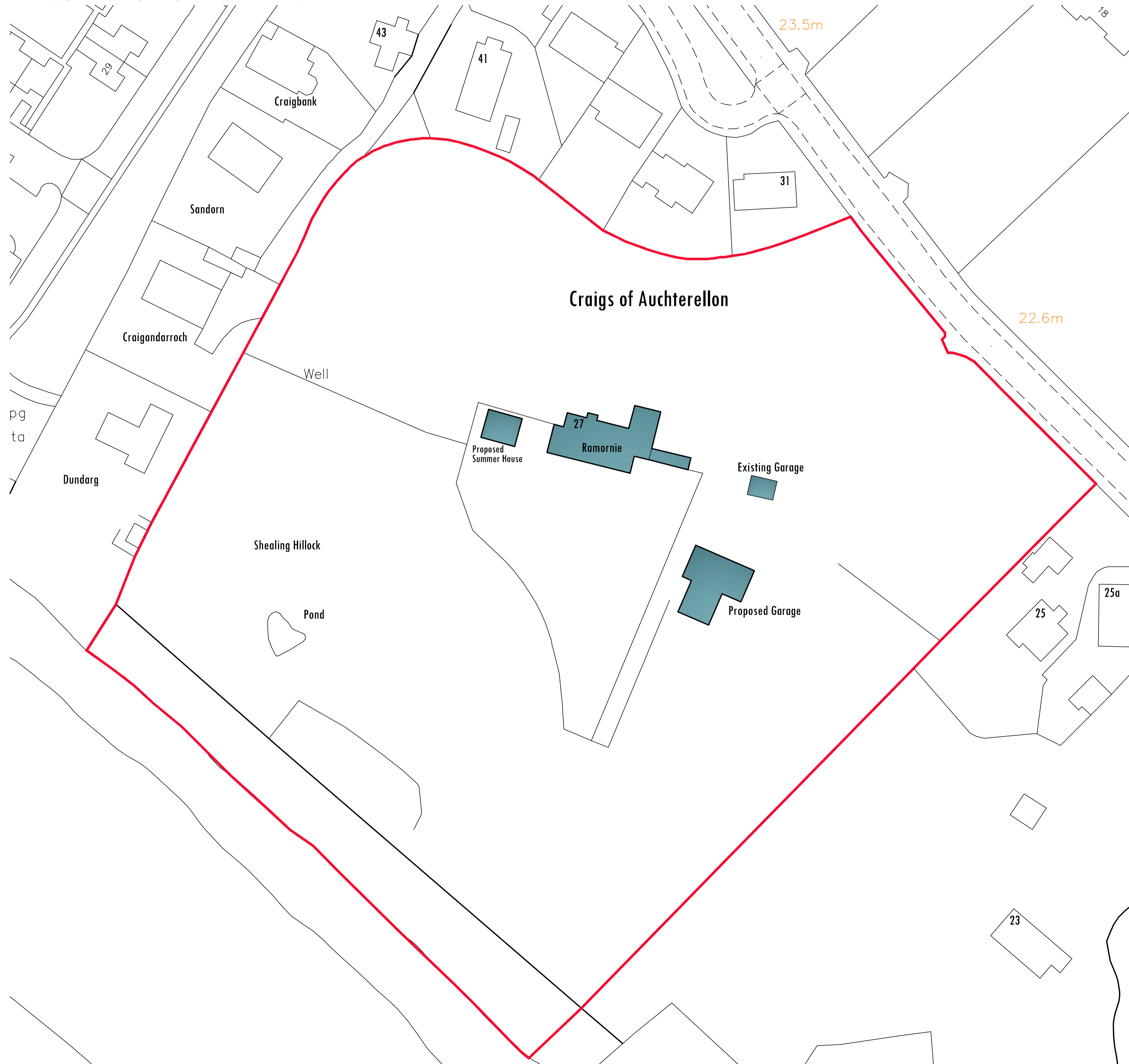
PROPOSED LAYOUT PLAN SCALE 1:500 @ A1

Crown copyright and database right. All rights reserved. Ordnance Survey licence no 100049616