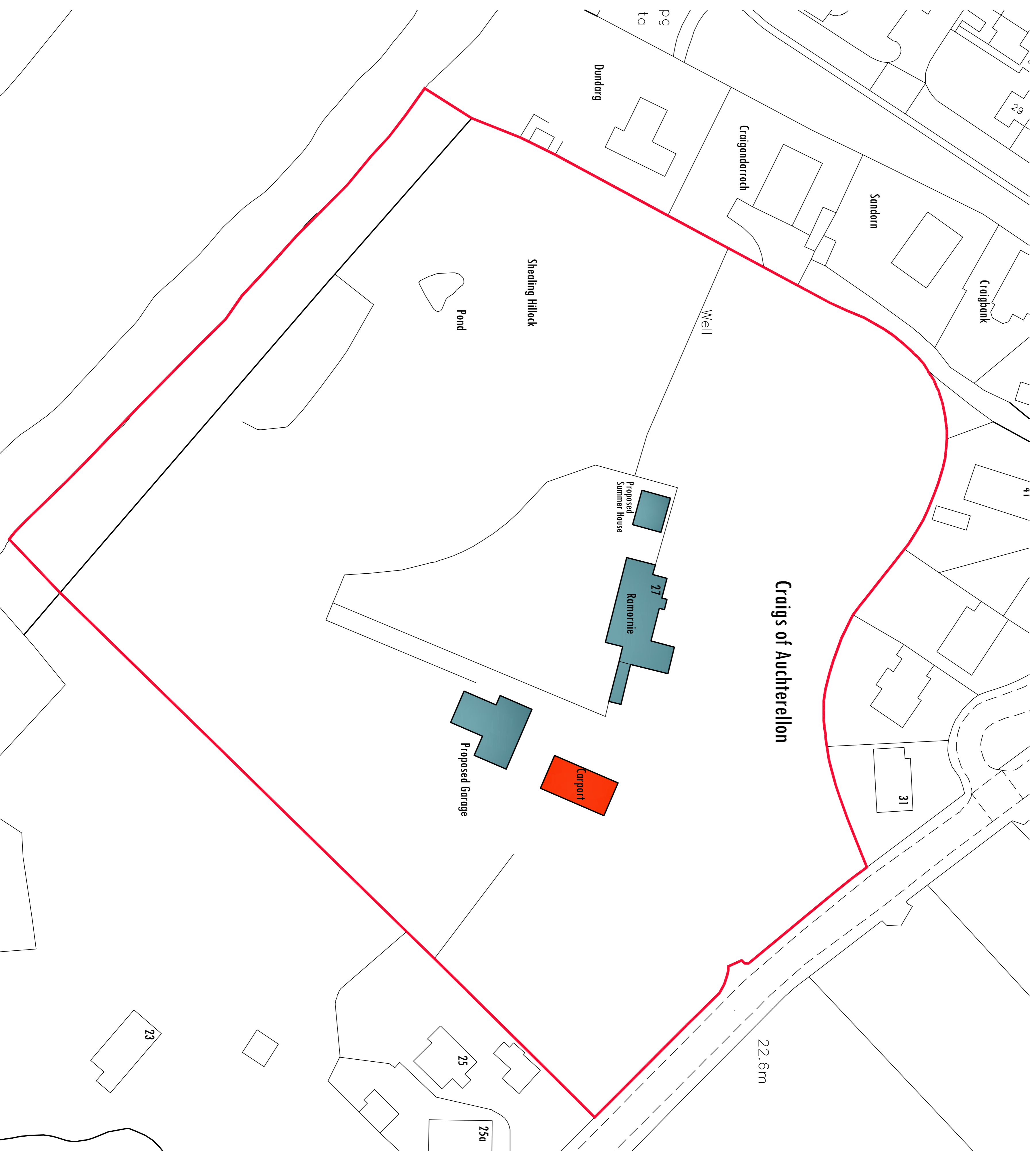
PROPOSED LAYOUT PLAN SCALE 1:500 @ A1

Crown copyright and database right. All rights reserved. Ordnance Survey licence no 100049616