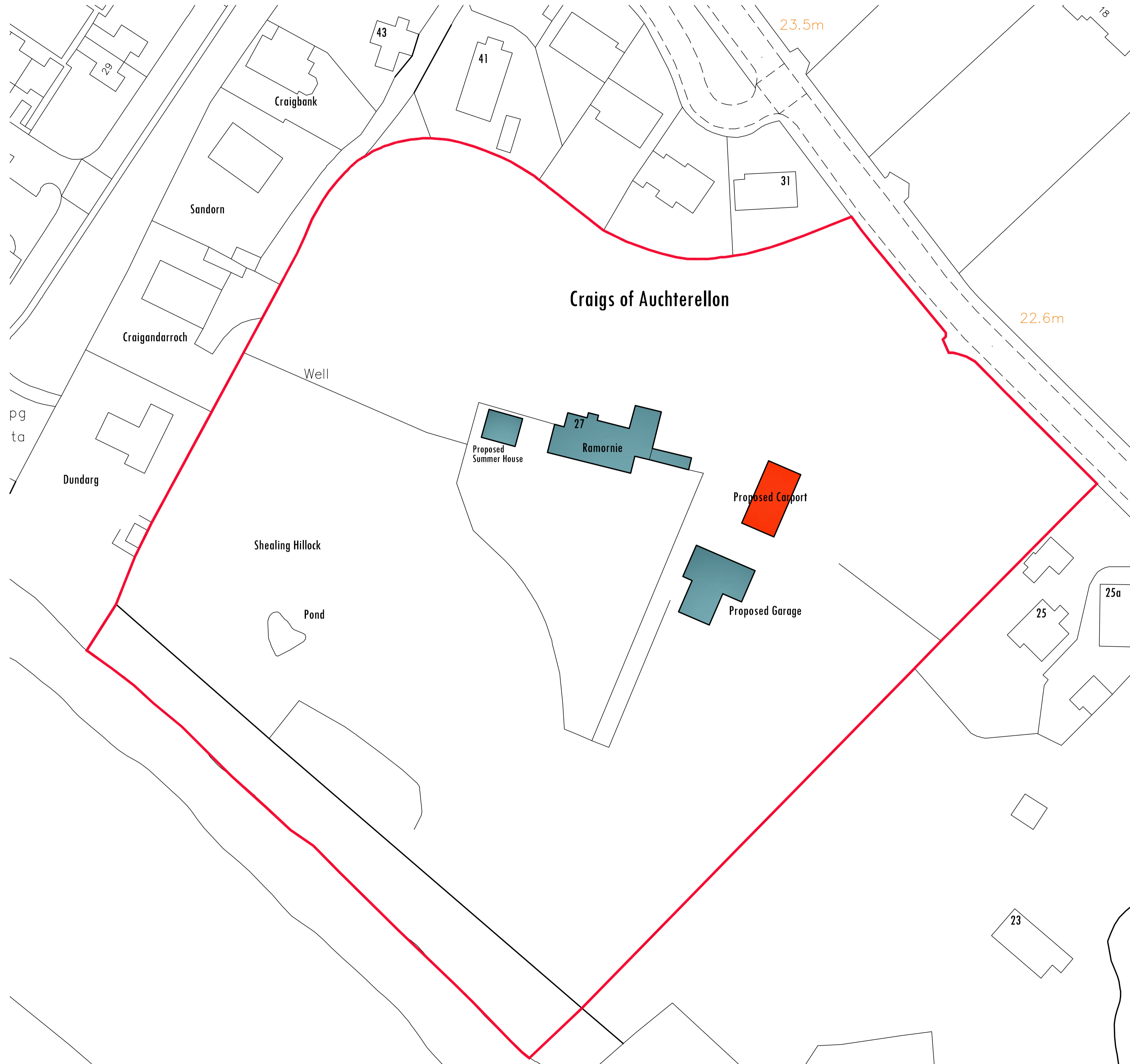
PROPOSED LAYOUT PLAN SCALE 1:500 @ A1

Crown copyright and database right. All rights reserved. Ordnance Survey licence no 100049616