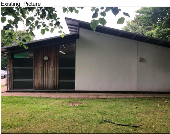
04 Existing Rear Elevation 1:100