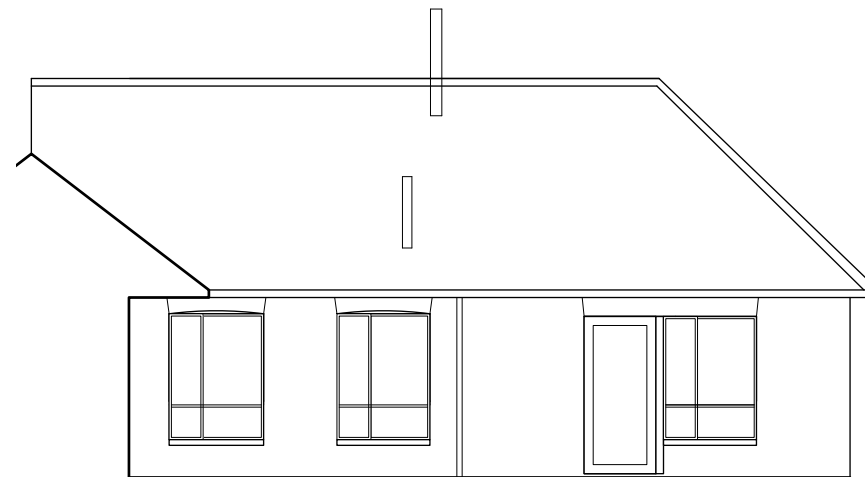
[1:100] PROPOSED WEST ELEVATION / SECTION