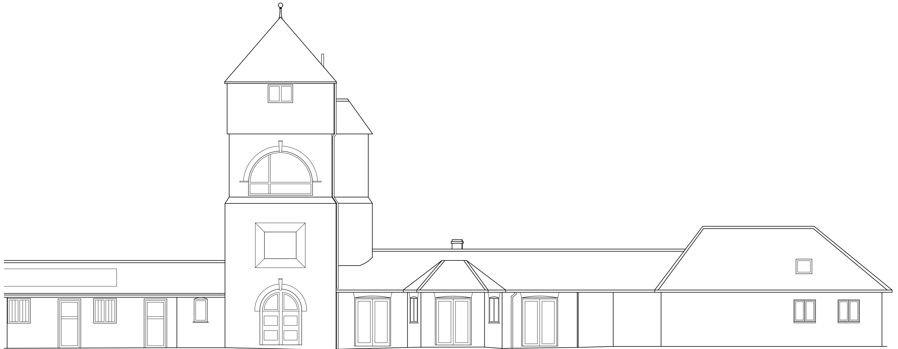
[1:100] EXISTING SOUTH ELEVATION