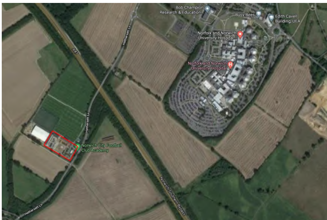
Figure 1.1: Site Location Plan