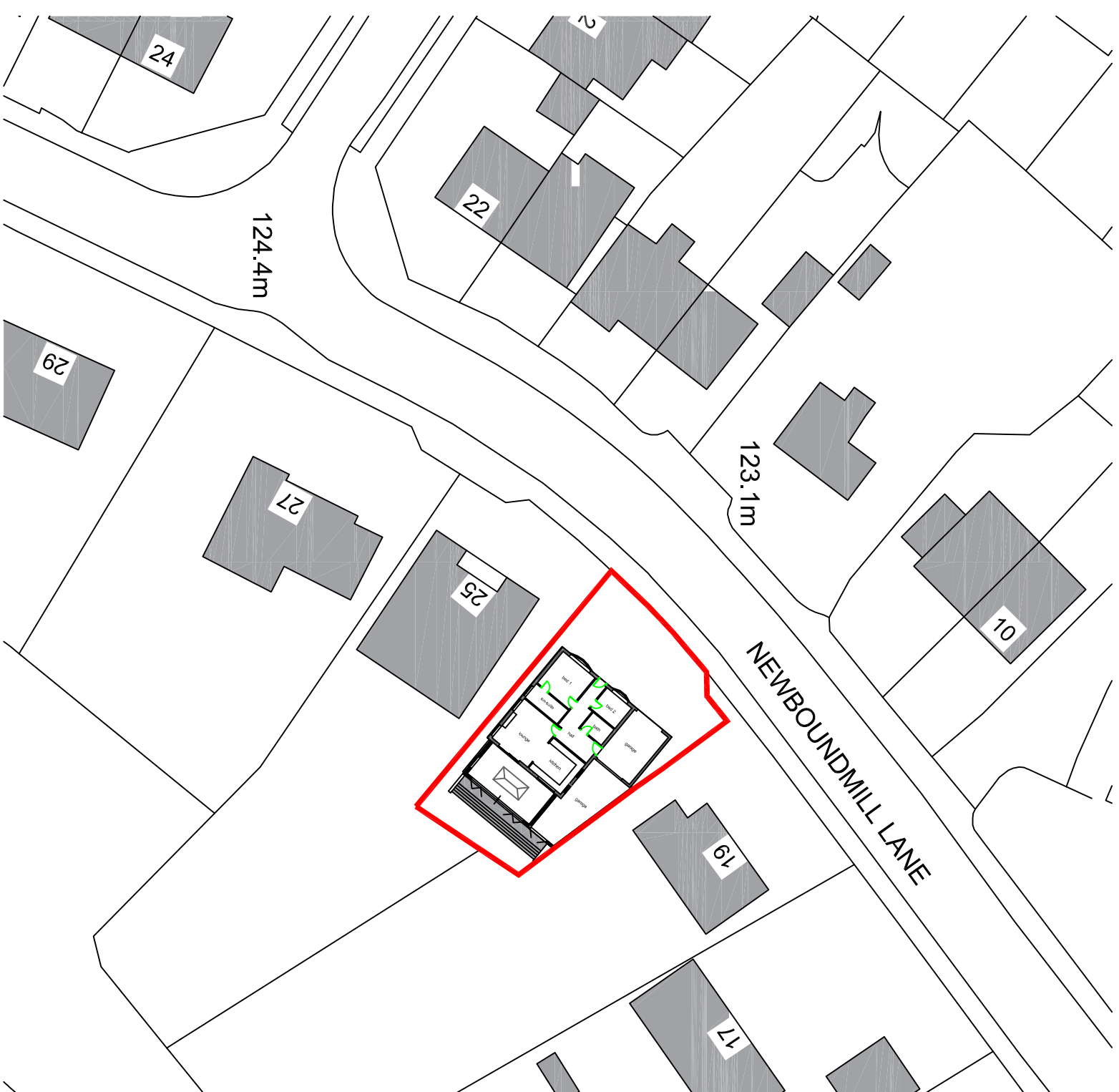
SITE PLAN (Scale 1:500)