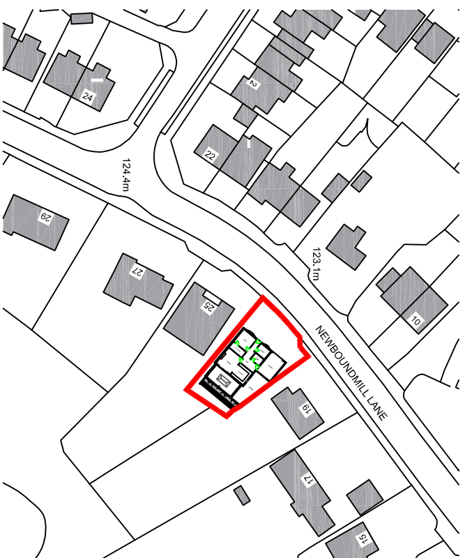
SITE LOCATION PLAN (Scale 1:1250)

This drawing is the property of chris orwin architectural design ltd. Copyright is reserved by them and the drawing is issued on the condition that it is not copied, reproduced, retained or disclosed to any unauthorised person, wholly or in part without the written consent of chris orwin architectural design ltd. All dimensions to be verified on site, do not scale drawing.