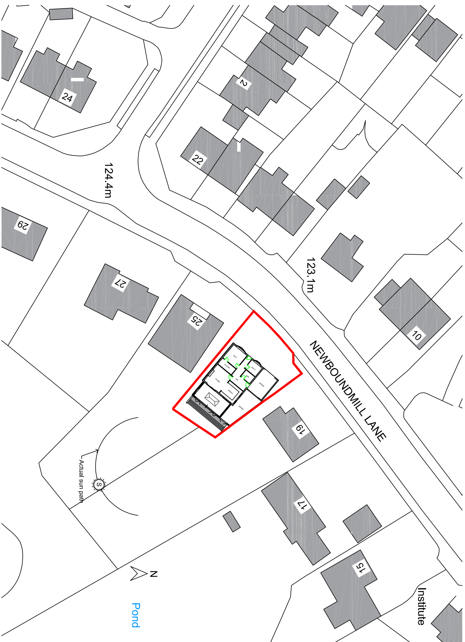
SITE PLAN (Scale 1:500)

This drawing is the property of chris orwin architectural design ltd. Copyright is reserved by them and the drawing is issued on the condition that it is not copied, reproduced, retained or disclosed to any unauthorised person, wholly or in part without the written consent of chris orwin architectural design ltd. All dimensions to be verified on site, do not scale drawing.